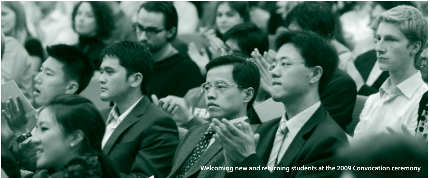
Welcoming new and returning students at the 2009 Convocation ceremony

In late August, The Fletcher School welcomed the 2009 incoming class to Medford for orientation, convocation, and the start of the new academic year. Once again, our MALD, M.A., and Ph.D. students were joined by the members of our newest degree programs: the Master of International Business (MIB) and the Master of Laws in International Law (LLM), both in their second year of existence. It was an exciting and demanding year for Fletcher's admissions office, as overall applications were up 11% compared to the previous year and marked the second highest application pool in the School's history.