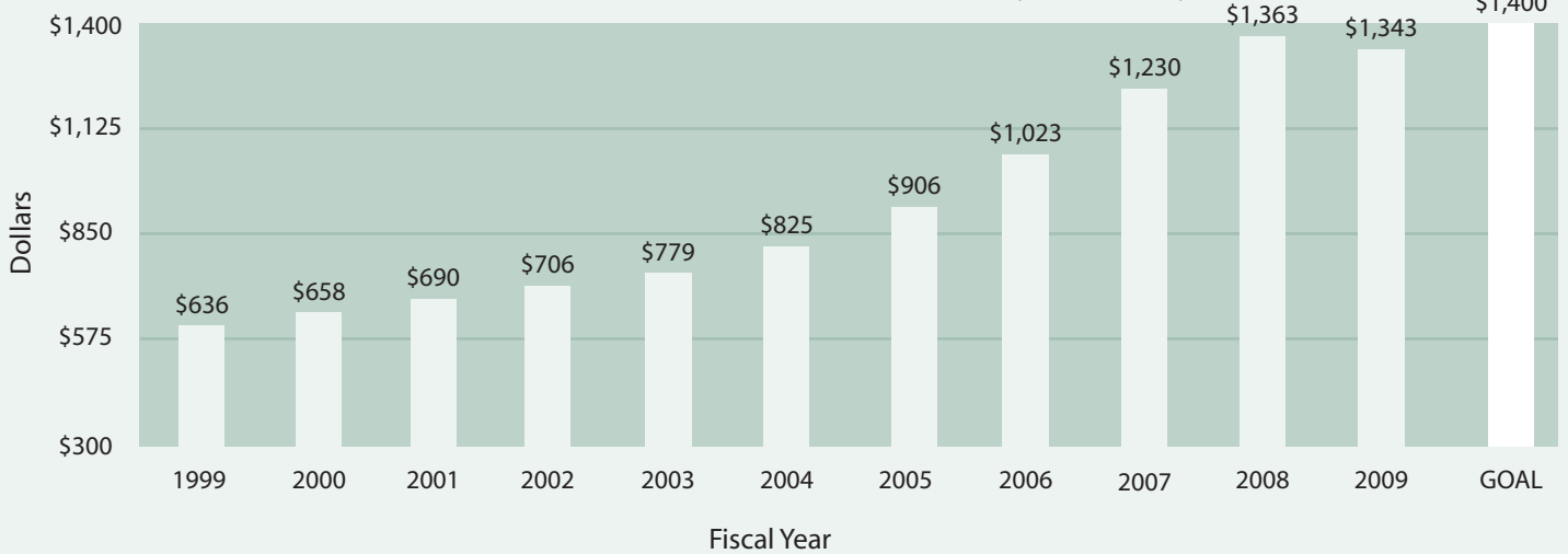
The Fletcher Fund Achievement Fiscal Years 1999-2010 (in thousands)