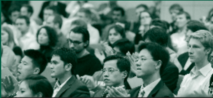
Fletcher welcomes its newest class

THE OFFICIAL NEWSLETTER FOR ALUMNI AND FRIENDS OF THE FLETCHER SCHOOL OF LAW AND DIPLOMACY AT TUFTS UNIVERSITY.