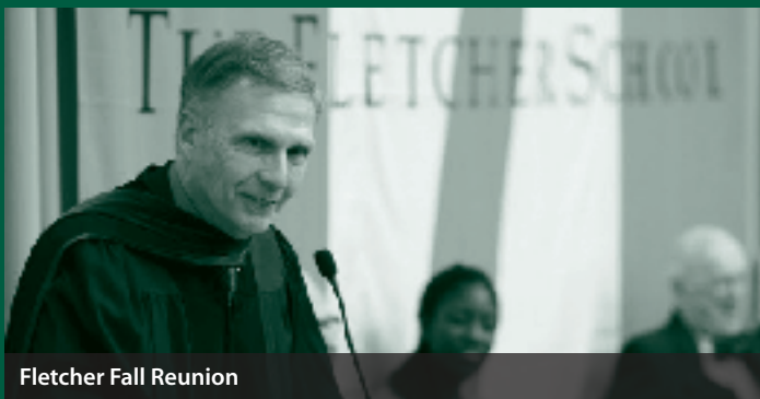
Fletcher Fall Reunion