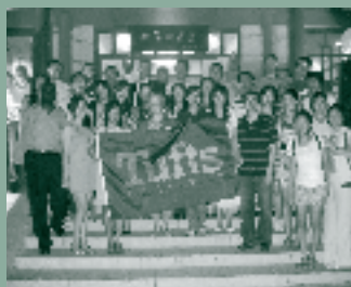
Tufts Beijing Alumni Event