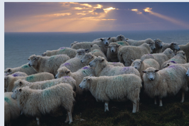
Romney sheep, Morte Point, Devon.