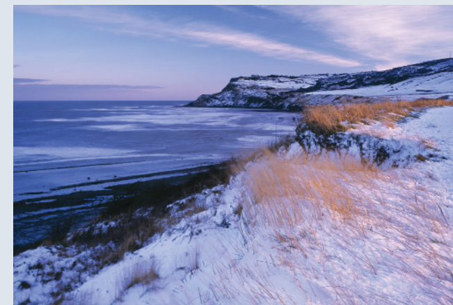
Snow at Boggle Hole, North Yorkshire.