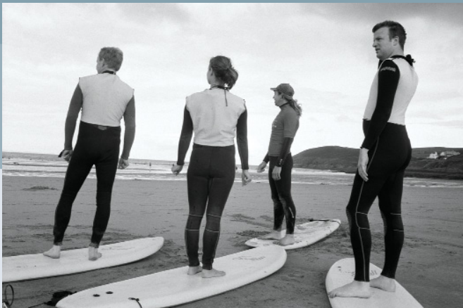
Surfers at Croyde Bay, Devon.