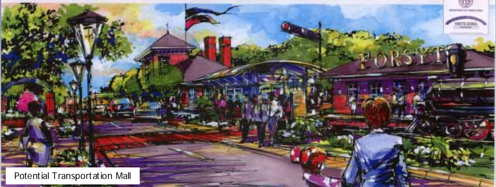
Potential Transportation Mall