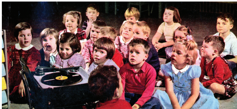
This photo was published in Sewickley Speaking Summer 2008 with a call for help to identify these students.