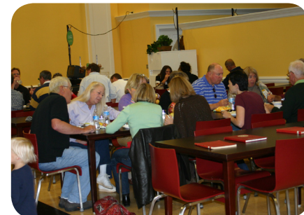
Alumni enjoying lunch in MS/SS Cafeteria. Not the same food they remember!