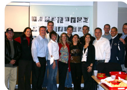
Class of '88