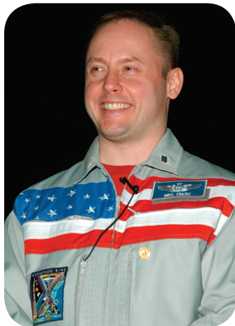
Col. E. Michael Fincke '85

Air Force Col. E. Michael Fincke '85 is commanding NASA's Expedition 18 to the International Space Station. This is Fincke's second trip to space and if the schedule remains, he'll be one of only three American astronauts to have spent more than 365 days in space. Fincke will not be returning to earth until March 2009. Expedition 18 will involve the installation of an oxygen-generation system, a secondary kitchen, additional bedrooms, and a filtration system that converts urine into water for drinking. Fincke will also be escorting Civilian Richard Garriott, the sixth paying customer to space, who acquired his fortune in video game programming. Garriott will return in 10 days with the Expedition Crew 17. Fincke graduated from Sewickley Academy in 1985 and attended Massachusetts Institute of Technology with an Air Force ROTC scholarship. He then received his master's degree in aeronautics and astronautics from Stanford University. Husband and father of three, he hopes to continue his space travel for as long as he can.