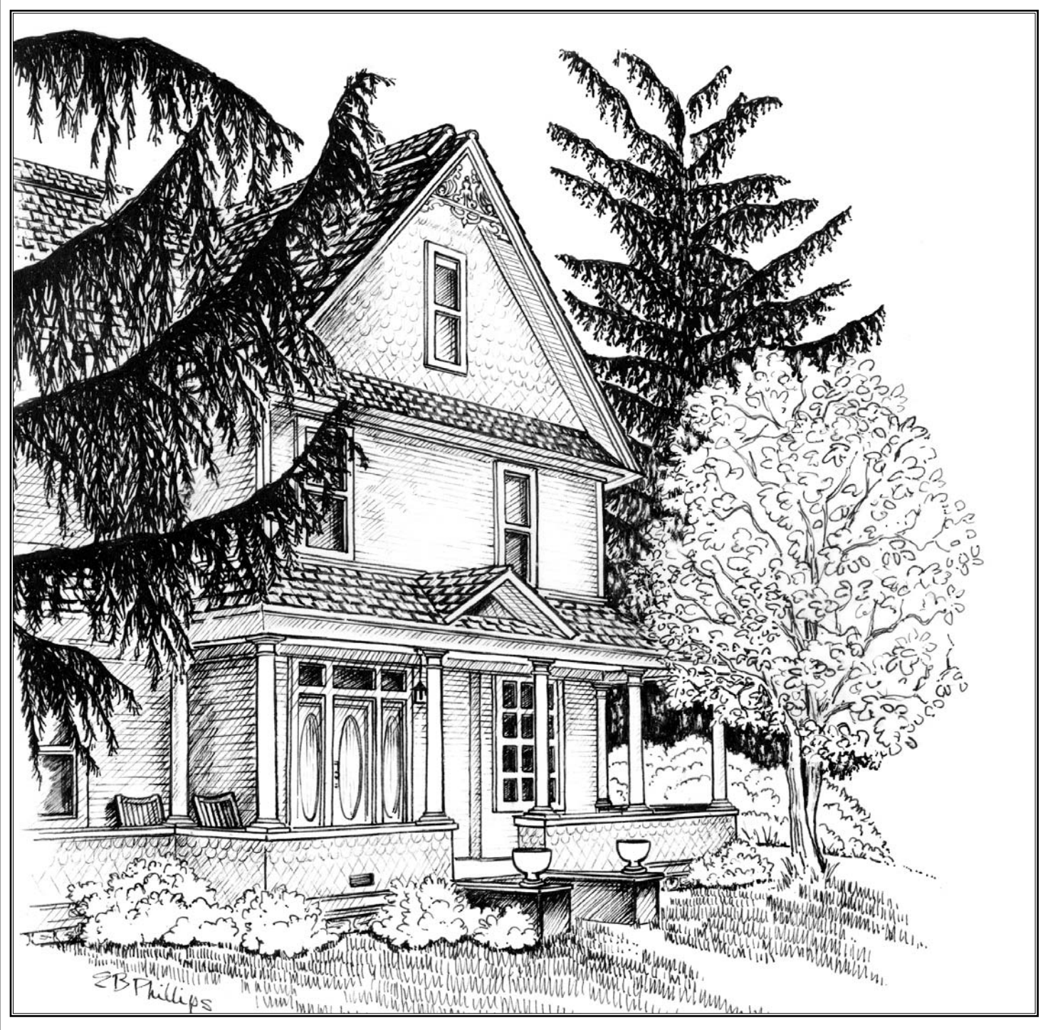
A Nineteenth Century Town May 2007

For additional information about Idaho call 1-800-VISIT-ID