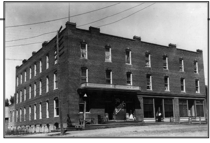
Alturas (Hiawatha) Hotel