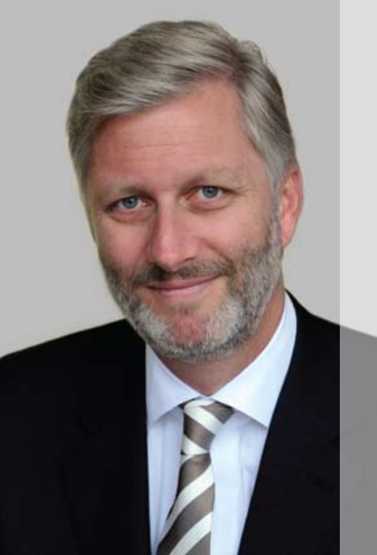
His Royal Highness PRINCE PHILIPPE OF BELGIUM