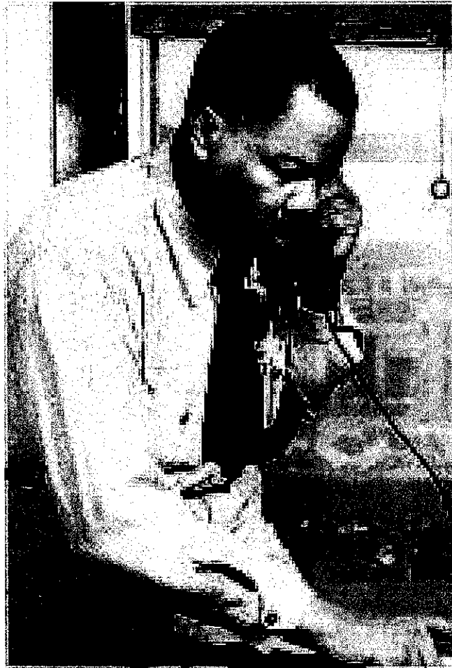
Frank Marshall Davis