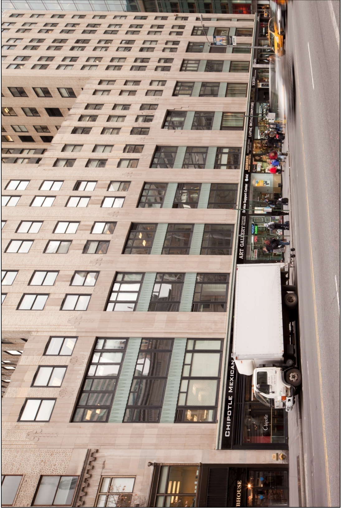
500 Fifth Avenue Building Ground-story storefronts and show windows on 42 nd Street.