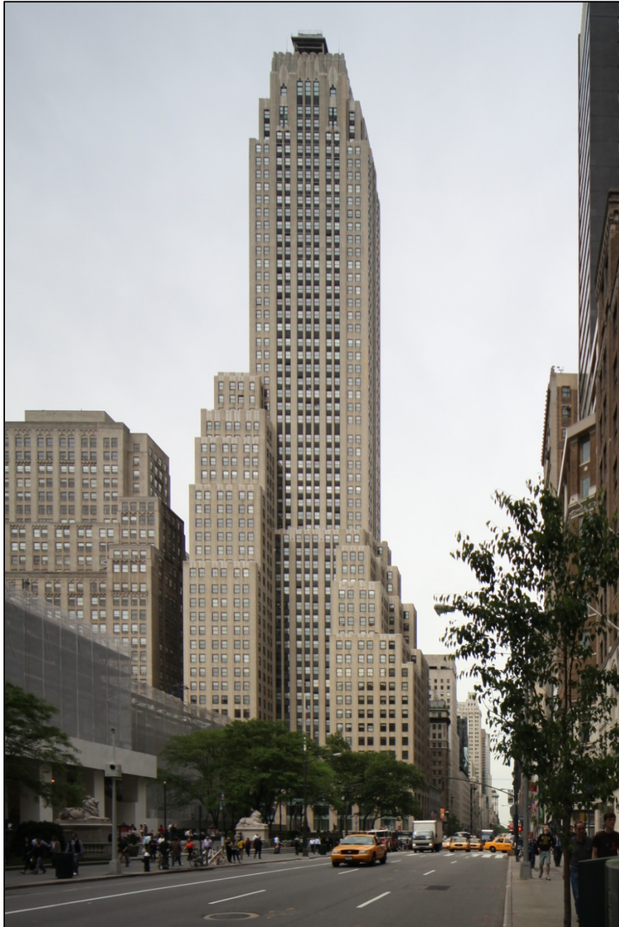
500 Fifth Avenue Building 500 Fifth Avenue, Manhattan Built: 1929-31 Photo: Christopher D. Brazee, 2010