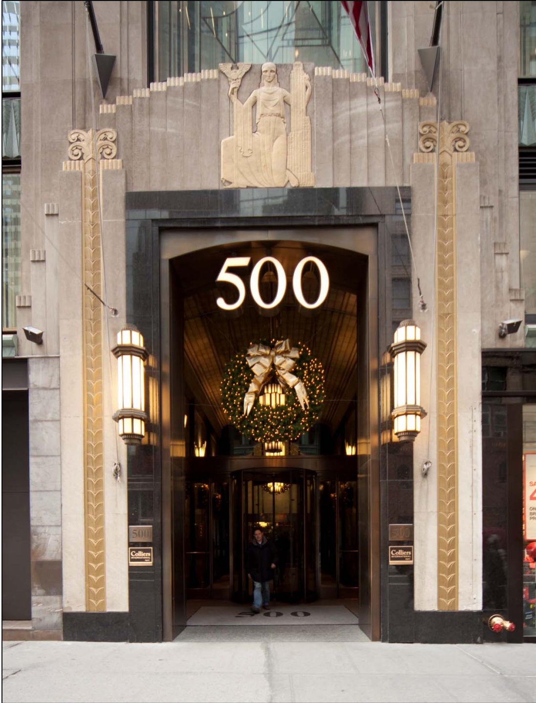
500 Fifth Avenue Building Main entrance on Fifth Avenue. Photo: Christopher D. Brazee, 2010