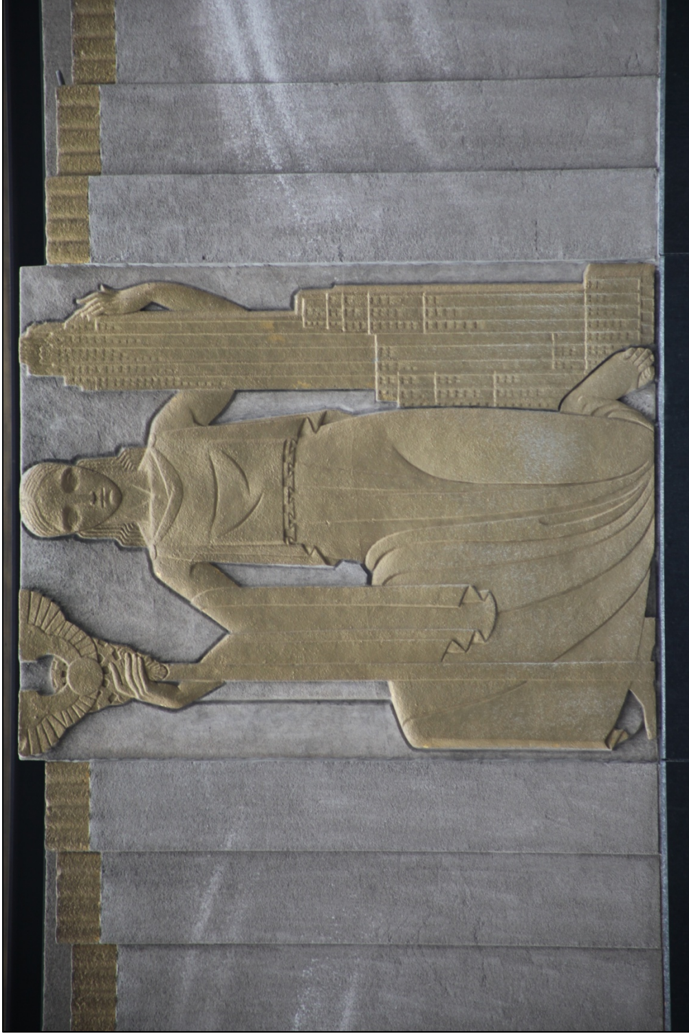
500 Fifth Avenue Building Allegorical bas-relief with miniature of 500 Fifth Avenue, sculpted by Edward Amateis, crowning main entrance. Photo: Christopher D. Brazee, 2010