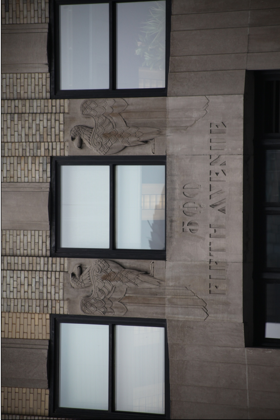
500 Fifth Avenue Building Carved eagles flanking 500 Fifth Avenue sign on 42 nd Street facade. Photo: Christopher D. Brazee, 2010