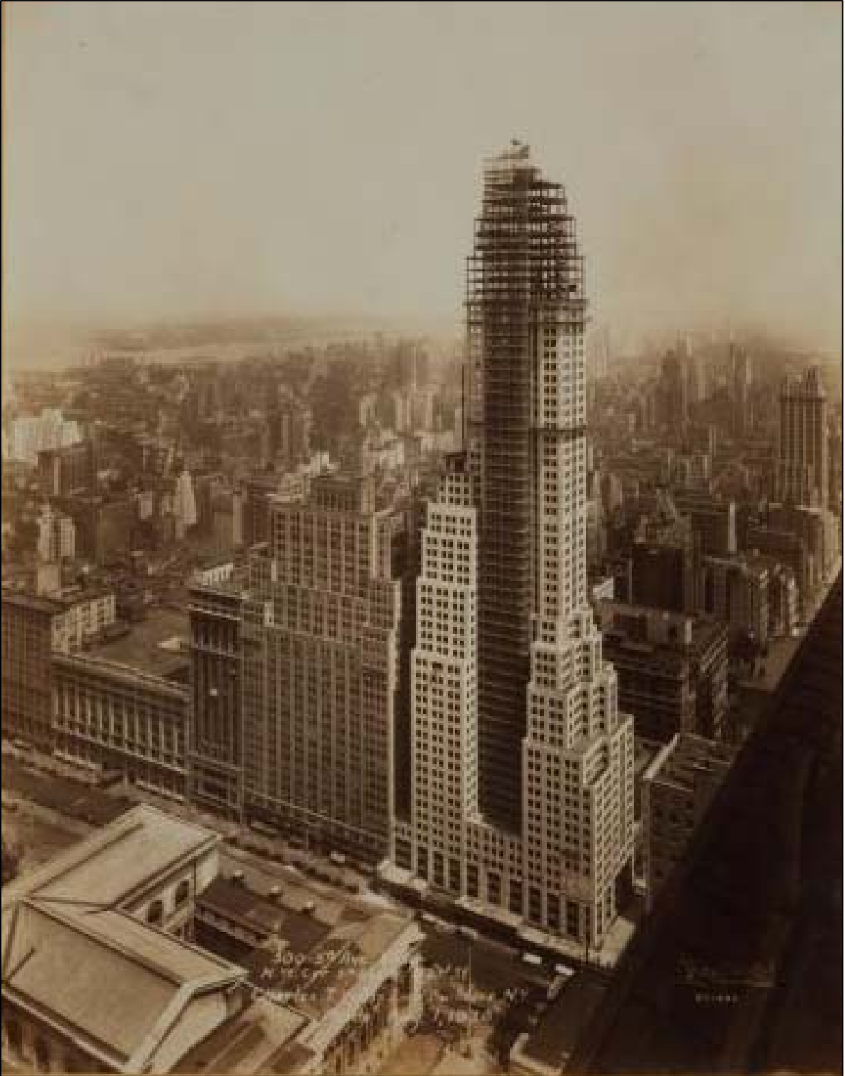
500 Fifth Avenue Building 500 Fifth Avenue during construction, 1930. Image courtesy of the New York Public Library (NYPL ID 708774F)