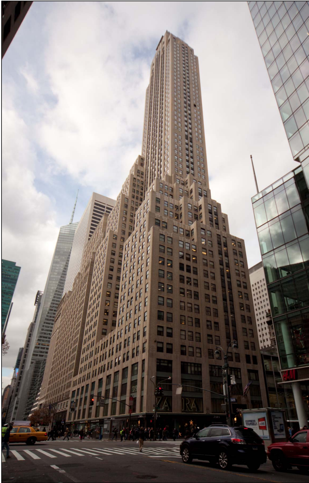
500 Fifth Avenue Building View west from 42 nd Street