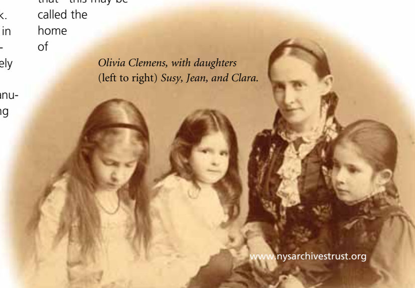
Olivia Clemens, with daughters (left to right) Susy, Jean, and Clara.

Beginning in 1870 and continuing until 1889, their summer months were spent in Elmira, where they stayed with Olivia's adopted sister, Susan Crane, and her husband, Theodore, at their home, Quarry Farm.