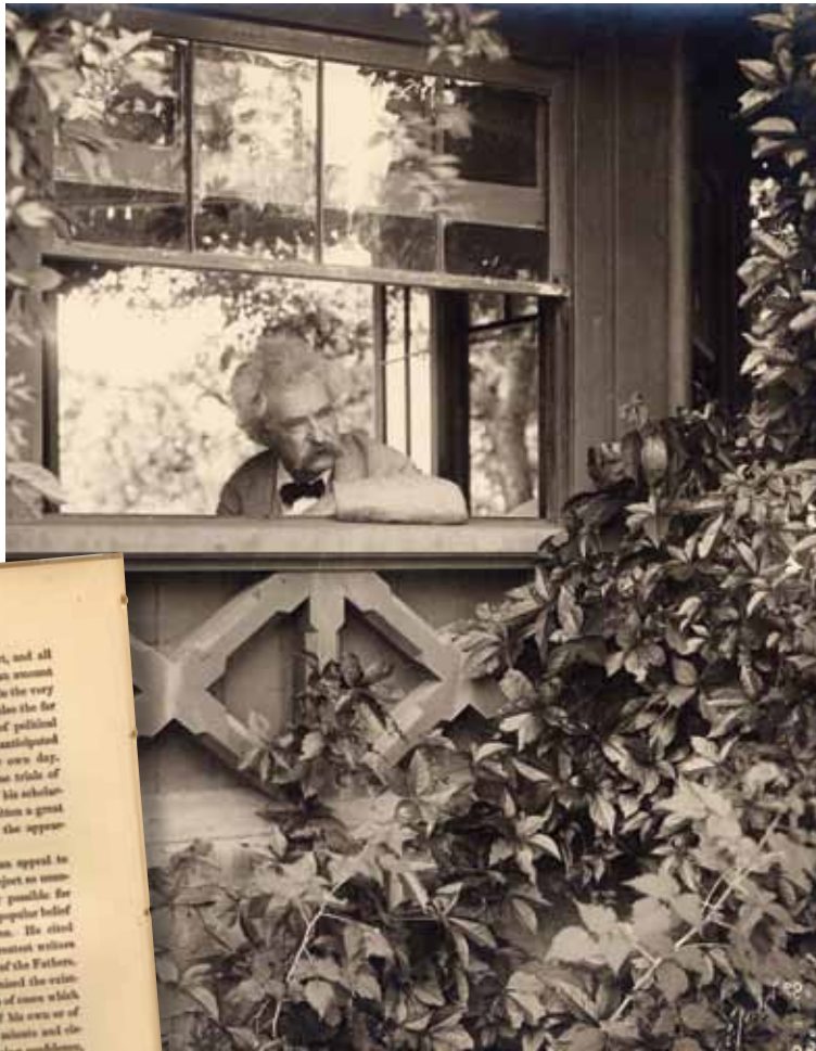
Sam Clemens in his study.

Huckleberry Finn and other books of mine, for they were written here."