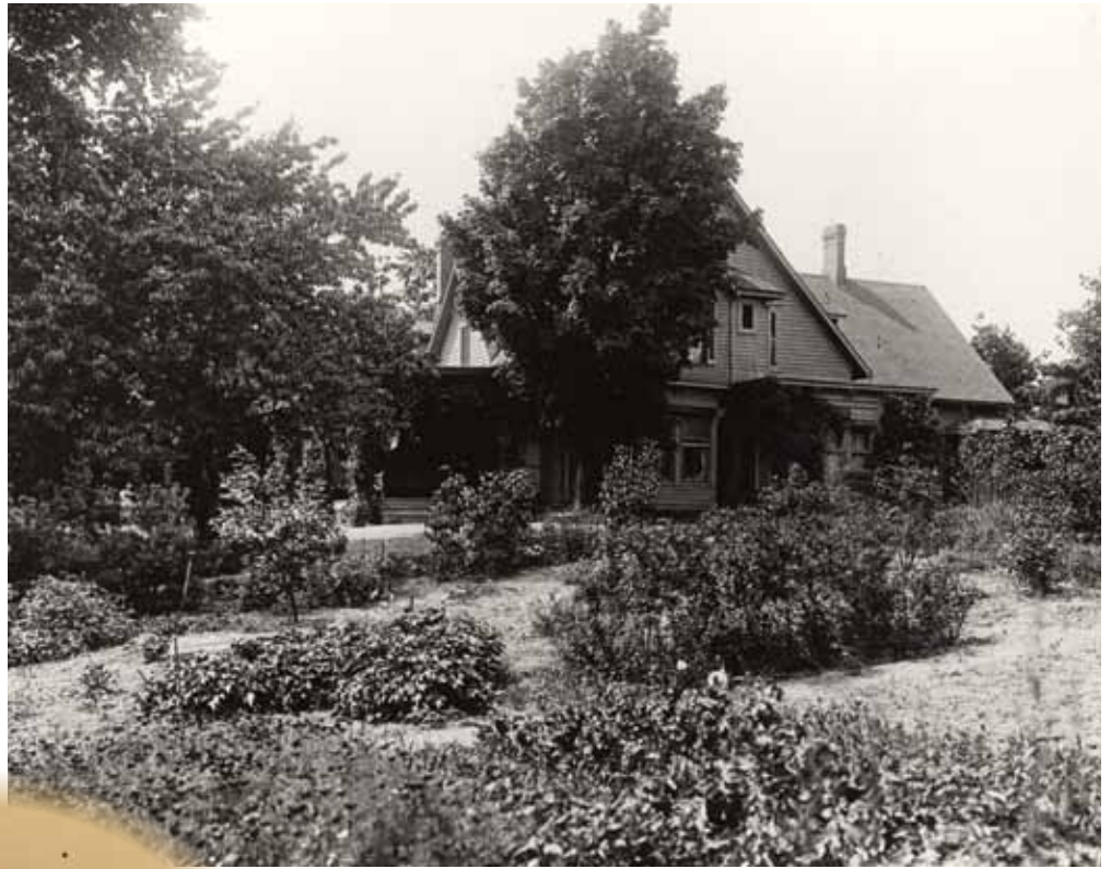
Samuel Clemens's name for Quarry Farm, which overlooked the Chemung River, was "Rest and Be Thankful."

As legend has it, while anchored in the Bay of Smyrna, Langdon showed Clemens a picture of his sister, Olivia, and Clemens immediately fell in love.