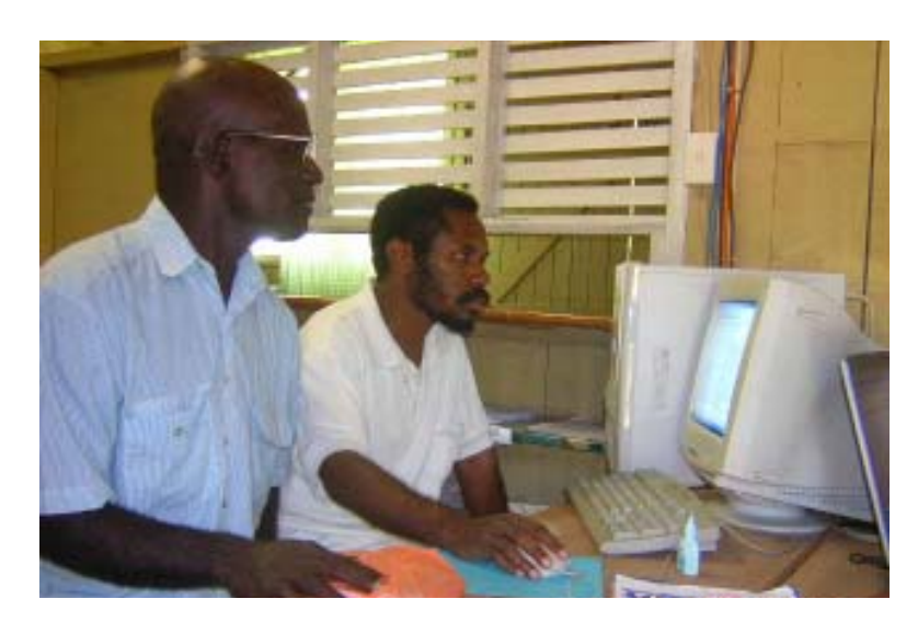
Above: Couple of bankers undergoing training in new banking software system.

Released at its headquarters at TONU, the plan will be driven by the Medium Term Development Strategy that