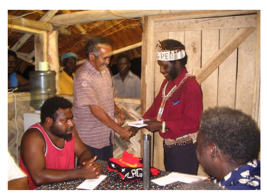
<u>Above:</u> Regional Governor for Asia-Pacific, Sir Uwau Imani, receiving his recognition and knighthood from HM King Peii II at royal staff mess, Tonu, RKP hg.