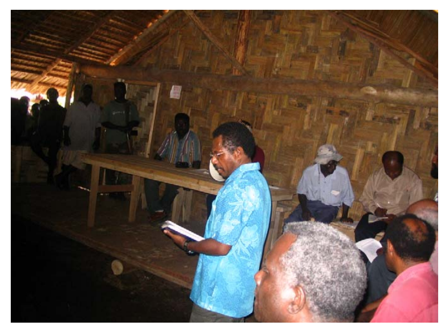
<u>Above:</u> UV Governor-General for Papua New Guinea, Sir Iairo Lasaro, giving his keynote speech at last week's UV governors' conference at Tonu.

The U-VISTRACT System will make the payouts through the Royal International Bank of MEEKAMUI and does not wish to see the wealth and riches kill the recipients before they get to enjoy them.