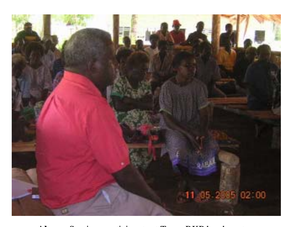
Above: Seminar participants at Tonu, RKP headquarters

He said everyone, including himself, come under close fellowship and scrutiny by our GOD who has brought his purpose in U-VISTRACT to fulfillment and remains the Chief Pilot of the mission.