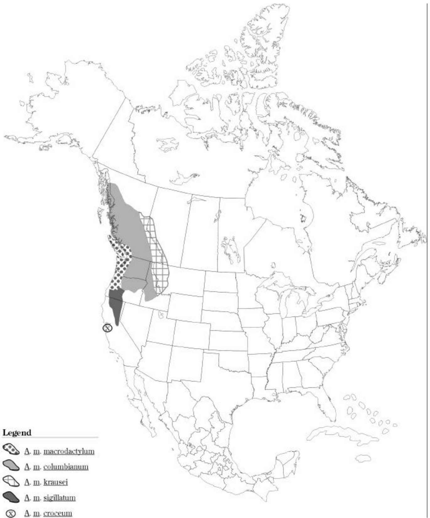
Figure 2. Distribution of the Long-toed Salamander in North America (modified from Stebbins 1985).