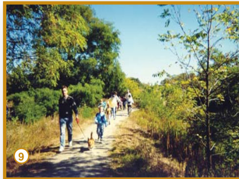
Hikers along the Mill Run Trail