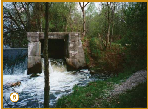
Silknit Dam Mill Race