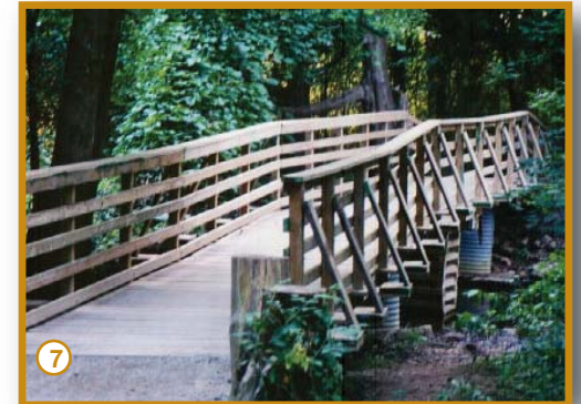
Bridge over Ellis Creek