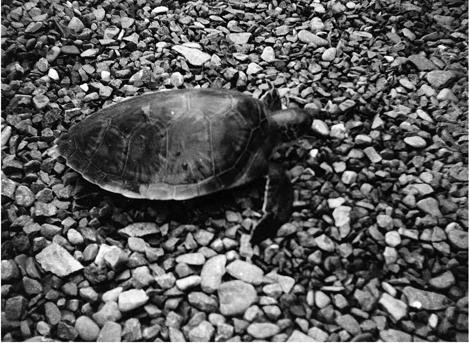
FIGURE 2. Juvenile Green Turtle ( Chelonia mydas ) found in Chedabucto Bay, Nova Scotia, on 8 August 1999.

was considered unusual by the inshore commercial fishers who encountered it because they had never seen a cheloniid turtle before. Therefore, they collected it and brought it to shore for examination.