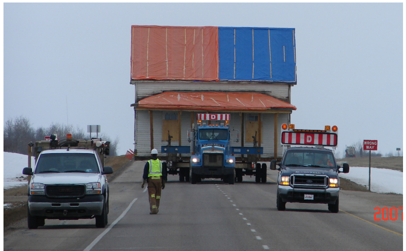
Hewko House is relocated to UCHV

Newsletter - We published two issues of our re-vamped Newsletter, one in June and one in August. The Newsletter contains not only information about the Friends Society but articles about how the Village was developed, how recent developments with the Enrichment program take place, and stories that focus on the history of east central Alberta. We distribute both hard paper and electronic copies, the electronic version featuring more detailed maps and illustrations. The fourth quarter installment is currently in production.