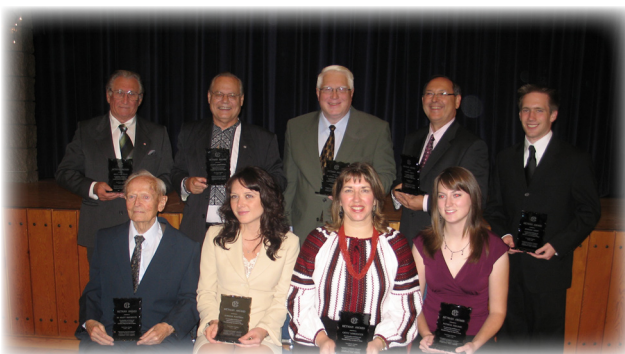
2006 HETMAN AWARD RECIPIENTS: