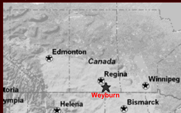
Figure 1: Location of Weyburn (*) in relation to other Cities

Weyburn is located in South Eastern Saskatchewan at the junctions of Highway #39 (north/south) and Highway #13 (east/west)