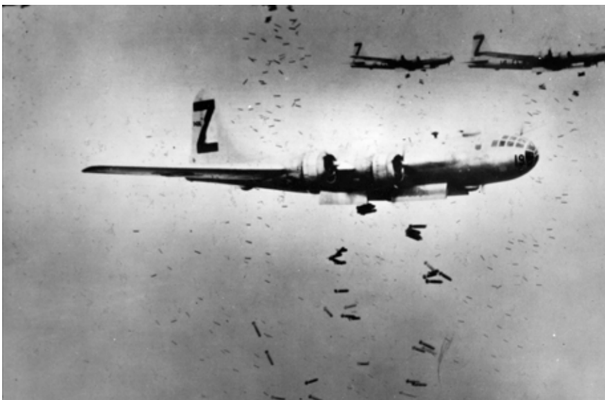
Heavy B-29 attacks devastated Japan even before the atomic bombs were dropped. Here, Superfortresses unload fire bombs on Yokohama in May 1945.

In Arnold's mind, he was racing against time. The Joint Chiefs had acceded to his desire to command the very long-range force from Wash-