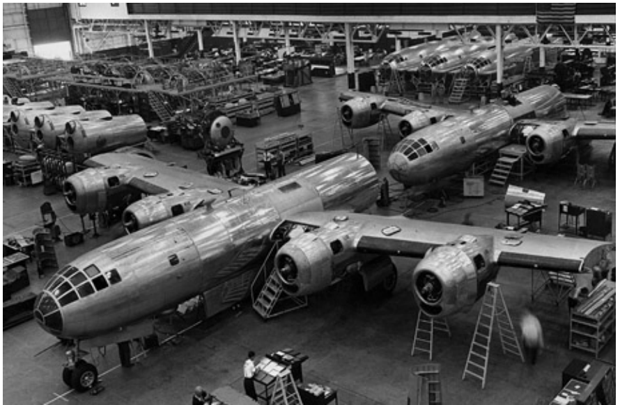
Pictured above are the Superfortresses under production. The B-29 brought a revolutionary capability. The long-range bomber featured a pressurized cabin, intricate fire-control system, and powerful new engines.

Arnold wanted to ensure the B-29s were used first against Japan. In a May 1943 memo to Marshall, Arnold wrote: "If B-29s are first employed against targets other than against Ja-