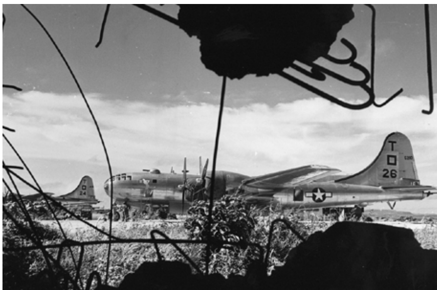
Above, a B-29 on Saipan is framed by the wreckage of a Japanese blockhouse. The capture of the Marianas was critical to the American war effort, as it brought the B-29s within range of Japan.

The conflict in the Pacific, however, was primarily in the hands of the Americans, and Arnold wanted