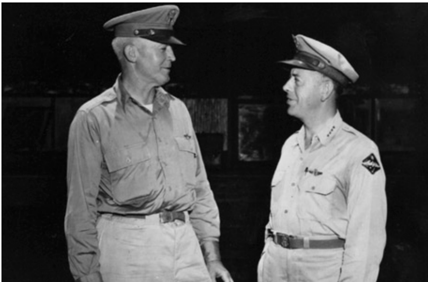
Gen. Hap Arnold, Commanding General of the Army Air Forces, and Gen. George Kenney, commander of Allied Air Forces in the Southwest Pacific, sparred over initial use of the B-29. Arnold's plan to strike Japan's home islands prevailed.

Before deploying the B-29s, Arnold moved to make sure that he had operational control over them. The official history of the Army Air Forces in World War II speculates that Arnold wanted to command Twentieth because he had not previously commanded combat units. In his memoirs, Arnold said that he was