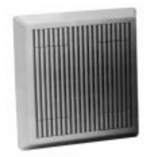
SERIES MT WITHOUT STROBE

The Multitone Strobe appliances are UL Listed for indoor use, ceiling and wall mount, under Standard 1971 (Signaling Devices for the Hearing Impaired) and Standard 464 (Audible Signal Appliances), and use a Xenon flashtube with solid state circuitry enclosed in a rugged Lexan® lens to provide maximum reliability for effective visible signaling. Options include LS, LSM, MS and IS Series which are Listed at 15, 15/75, 30 and 75 candela intensity. Also available with the WM (117cd) strobe model which is UL 1638 Listed for indoor or outdoor applications. The LSM 15/75 candela wall mounted strobes are Listed at 15 candela under UL 1971 and meet 75 candela intensity on axis for ADA guidelines with low current draw.