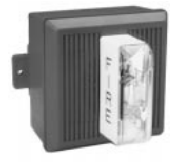
SERIES MT STROBE WITH IOB