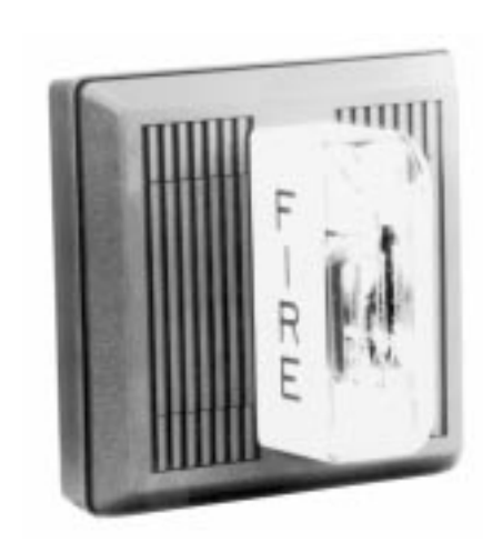
SERIES MT WITH STROBE