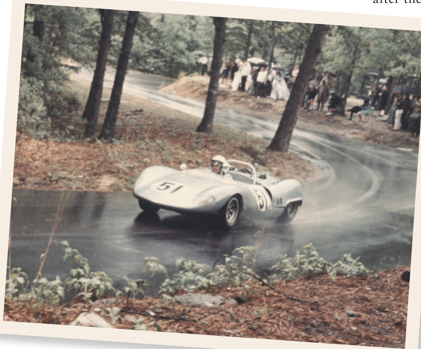
Start your engines: The hill climb's starting line attracted a wide variety of cars, including a Bobsy-Porsche (above) and a Mini Cooper (opposite).