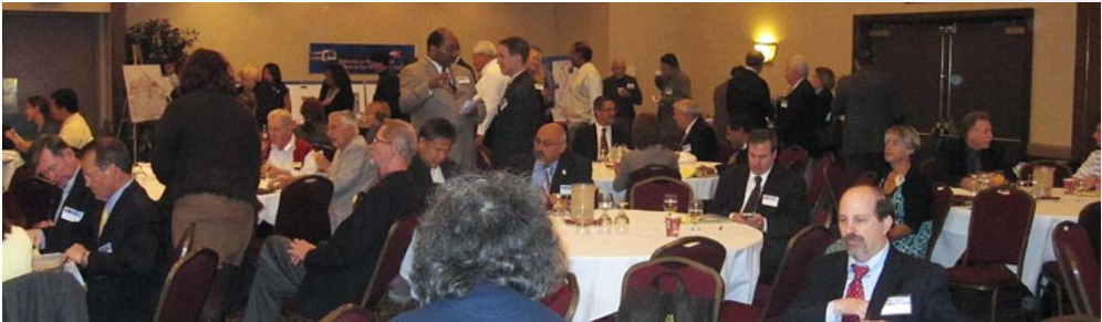
Stakeholders gather for start of Forum.