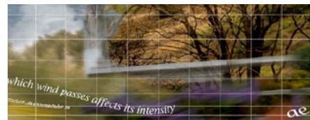
Up close view of images on sbX station shelter.

Blue icons Maintenance Facility/ Vehicle Activities