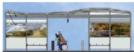
View of the overall sbX station shelter with artwork.

Images/Visuals: The primary imagery is a compilation of dreamlike views of the surrounding landscape – those visible at the Palm Kendall Station. Capturing motion and light, the interpretation is a painterly depiction of scenes at street view. Verdant, rich and nourishing color fields merge into a mix of neighborhood, local homes, bits of highway signs and traffic placed next to vegetation. Another layer of artwork is the inclusion of stimulating text.