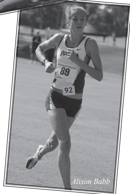
The 2007 women's team at the NCAA South Regional Meet, where they placed third overall.