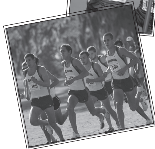
The 2007 men's team at the NCAA South Regional Meet, where they placed third overall.