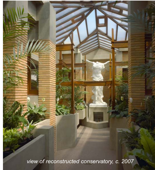
view of reconstructed conservatory, c. 2007