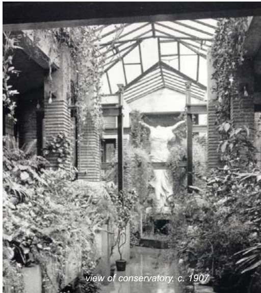
view of conservatory, c. 1907