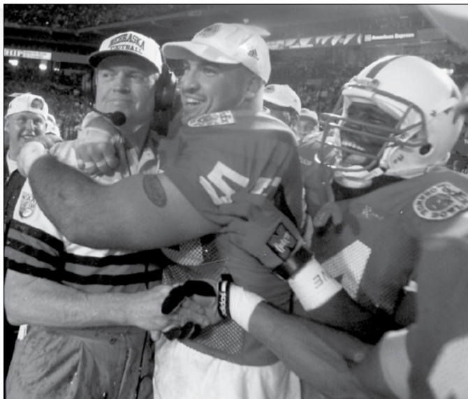
Hall of Fame Coach Tom Osborne.

Nebraska won three consecutive Big Eight championships from 1981 to 1983 and shared the title with Oklahoma in 1984. The Cornhuskers entered the Big 12 as winners of the last five Big Eight titles and reached the first Big 12 Championship Game in St. Louis. Had they not been upset by Texas, they would have played for yet another national championship in the 1997 Sugar Bowl game.