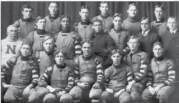
The 1905 Nebraska Cornhuskers.