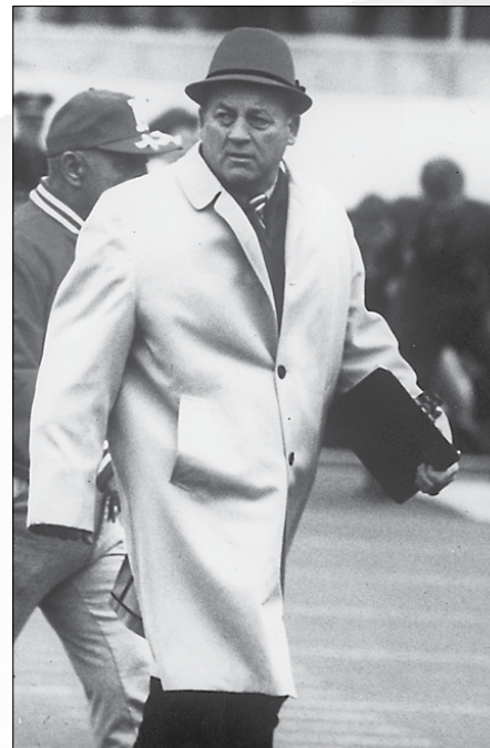
Hall of Fame Coach Bob Devaney.