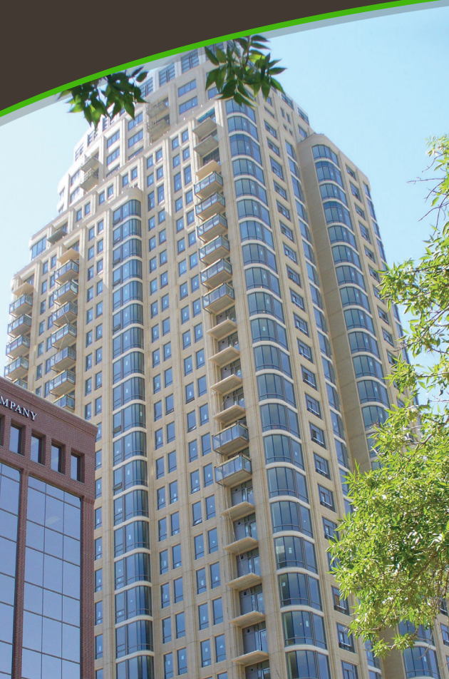
City Creek Center – Blocks 75 & 76, Salt Lake City, UT