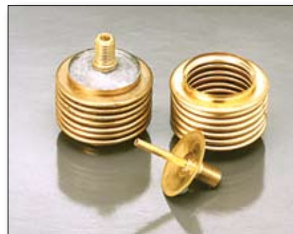
Brazed joints have great strength.

Of all the methods available for metal joining, brazing may be the most versatile. Brazed joints have great tensile strength – they are often stronger than the two metals being bonded together. Brazed joints repel gas and liquid, withstand vibration and shock and are unaffected by normal changes in temperature. Because the metals being joined are not themselves melted, they are not warped or otherwise distorted and retain their original metallurgical characteristics.