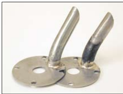
A controlled atmosphere eliminates oxidation.

A controlled atmosphere can be produced in a vacuum furnace, a sealed "glove box" or with an atmospheric bell jar. With a bell jar system, the parts are positioned before the bell jar is lowered into place and the controlled atmosphere is created. The glove box system is ideal for processes which require hands-on heating control. Learn more about brazing equipment.