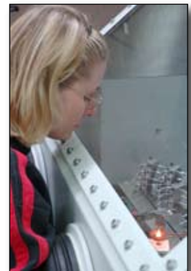
Contract brazing services

Our modern induction heating technology delivers strong, high quality braze joints; since induction is a highly directional and non-contact heating method, we are able to heat only the joint area, without affecting the surrounding areas. Our induction systems eliminate the inconsistencies of flame brazing, delivering consistently high quality joints with maximum repeatability. Our compact induction furnace is ideal for unusually sized parts, parts with multiple joints, or "orphans" from other heating processes. Our semi-automatic indexing turntables will meet your needs for high volume production. Whatever your volume requirements and part dimensions, we can provide a cost-effective contract brazing solution.