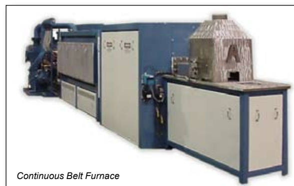
Continuous Belt Furnace