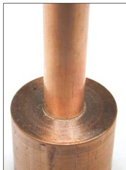
Brazed provides a clean, well-finished appearance.

It is also important to consider the physical characteristics of the parts and joint area. Because of its high temperature requirements, welding works best with relatively strong, thick parts