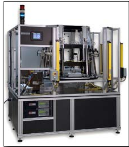
IA automated brazing system

The selection of a gas for atmospheric brazing depends on a variety of process requirements including purity and heating temperature as well as cost considerations. The engineers at Induction Atmospheres have extensive experience in selecting the best atmosphere for a specific combination of material being brazed and filler metal, and have prepared a helpful Atmosphere Comparison Matrix. An additional Filler Metals Comparison Chart provides information about various filler metal characteristics.