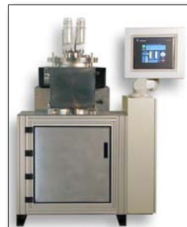
High Vacuum Brazing System