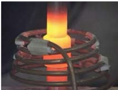
Brazing in a protective atmosphere

When brazing is done in the open air, the joints are normally pre-coated with flux, a chemical compound which protects the part surfaces from air. A flux coating helps prevent oxidation when the metal heats up, protects the braze alloy and improves its flow. As heat is applied to the joint, the flux will dissolve and absorb the oxides that form. A variety of fluxes are available for use at different temperatures, with different metals and for a variety of environmental conditions. The point to remember is that the flux should melt and become completely liquid before the alloy melts. Most often flux is sold in paste form so it can be brushed on to the parts just before the actual heating cycle.