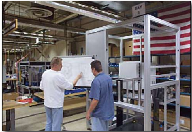
Our turnkey systems are designed for lean, continuous flow manufacturing.

With over 100 years of combined engineering experience, our engineers will help you reduce cycle time, improve part quality and minimize utility costs. If you're interested in developing a lean, continuous flow manufacturing process, call us today at 1.585.368.2120 or send us an e-mail.