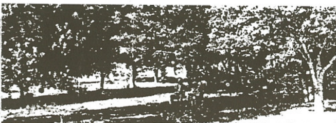
The Jessephs relax in their oak grove