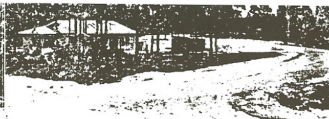
Dayton Blvd. and Savannah Drive