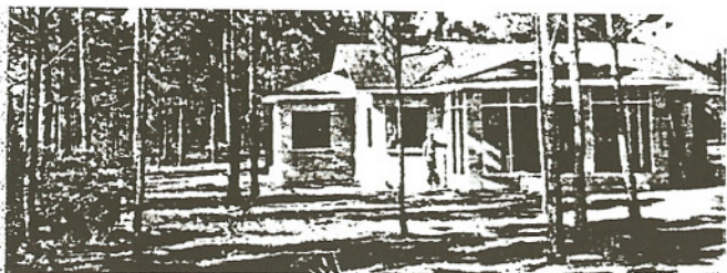
"The Turning Point" Home of Alice Carr