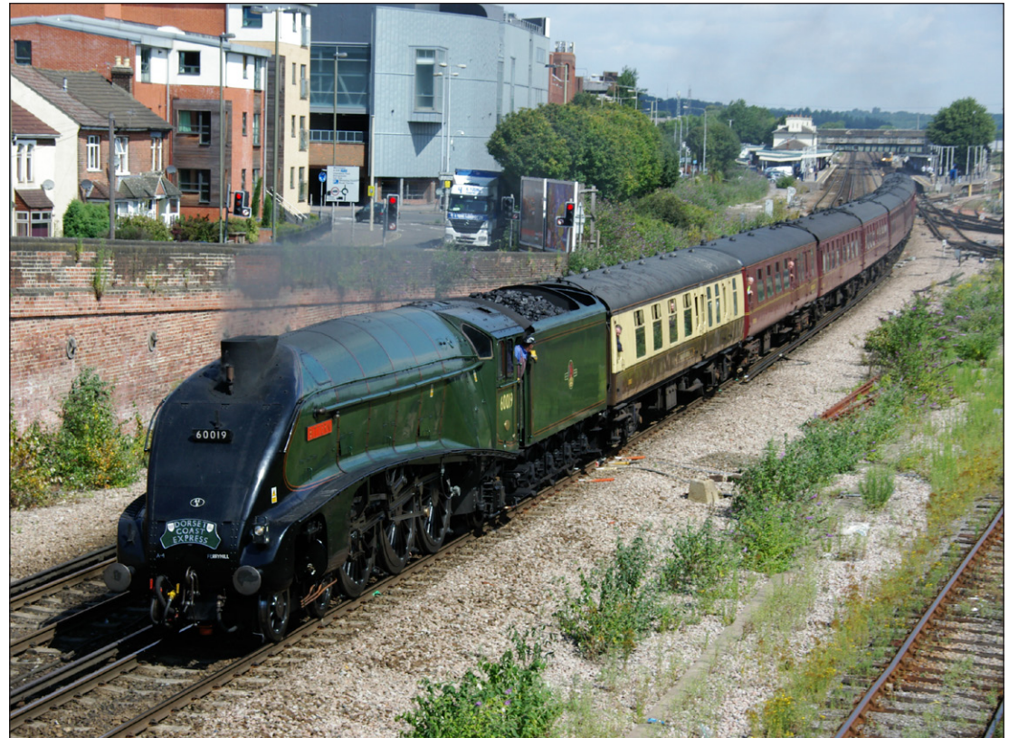
▲ Gresley A4 class Pacific No. 60019 Bittern returned to the main line on 28th July after a protracted absence, being used to work the Dorset Coast Express from London to Weymouth. Here, well away from its home territory, the 'A4' passes Eastleigh on the outward journey. Mervyn Turvey

The DTG expects the repairs to be very expensive, and donations from those who have enjoyed the thrill of riding, photographing or just watching 'Champion' on any of its 50 railtours or heritage line visits would be very gratefully received. Further details can be found on www.westernchampion.co.uk .