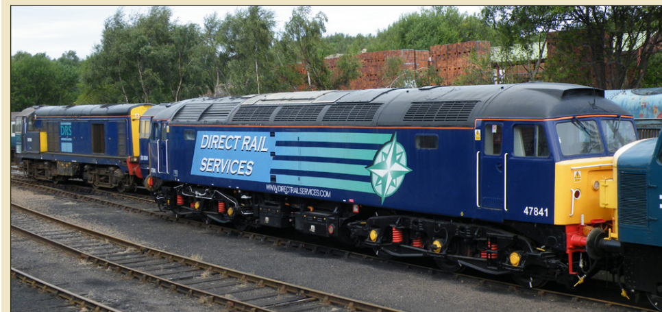
▲ DRS-liveried Class 47/4 No. 47841 stands in the yard at Barrow Hill on 25th July, having freshly outshopped. Behind the loco are DRS Class 20/3s Nos. 20315 and 20308, both of which had recently arrived from Crewe Gresty Bridge.

The final alignment of the track is done with lasers before the rails are secured into position. Almost the last piece in the jigsaw is to put back the third-rail that carries the 750 volts of electricity needed to power the trains, before the stations are given a thorough clean ready for passengers to start using them again.