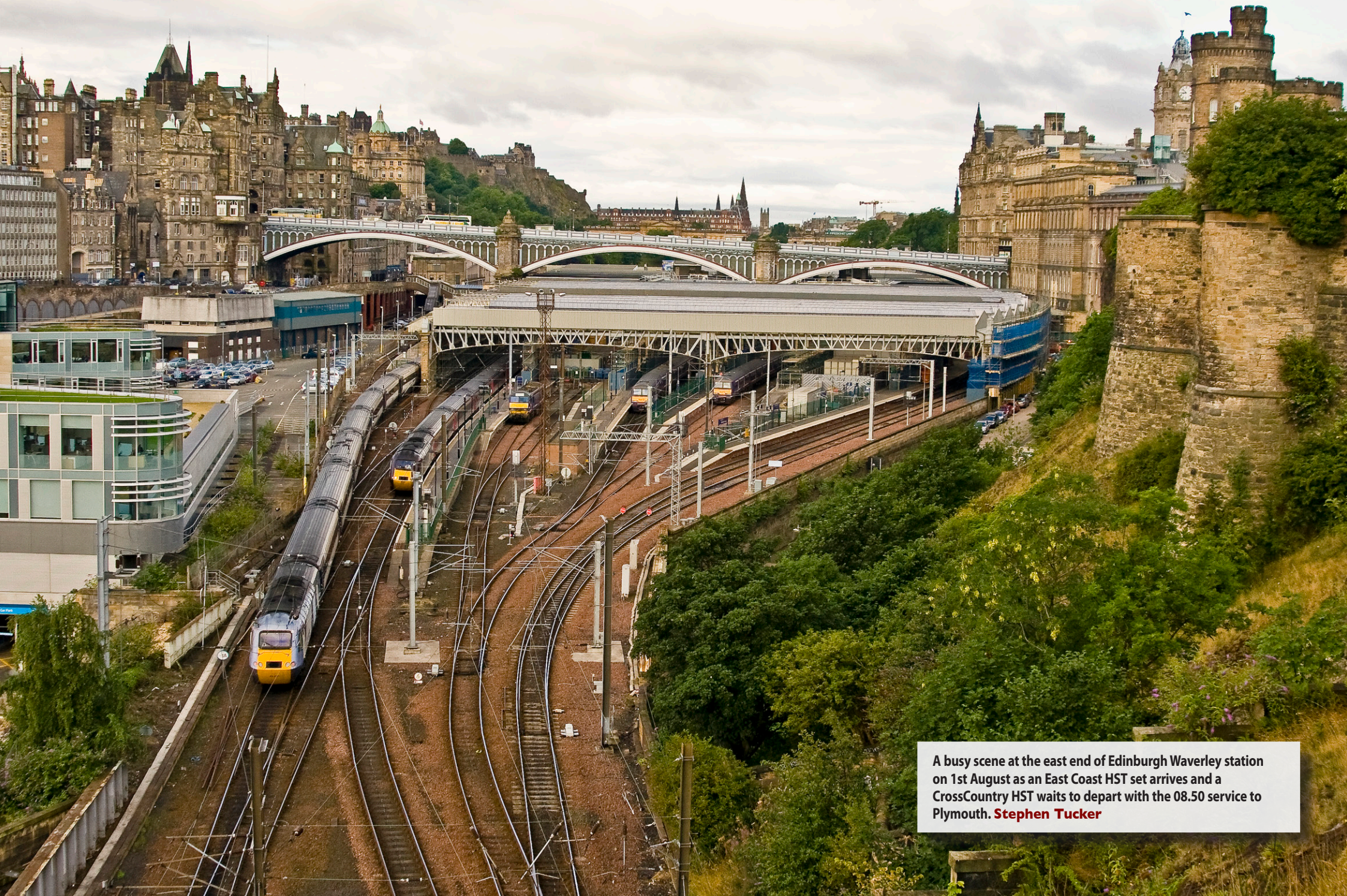
A busy scene at the east end of Edinburgh Waverley station on 1st August as an East Coast HST set arrives and a CrossCountry HST waits to depart with the 08.50 service to Plymouth.