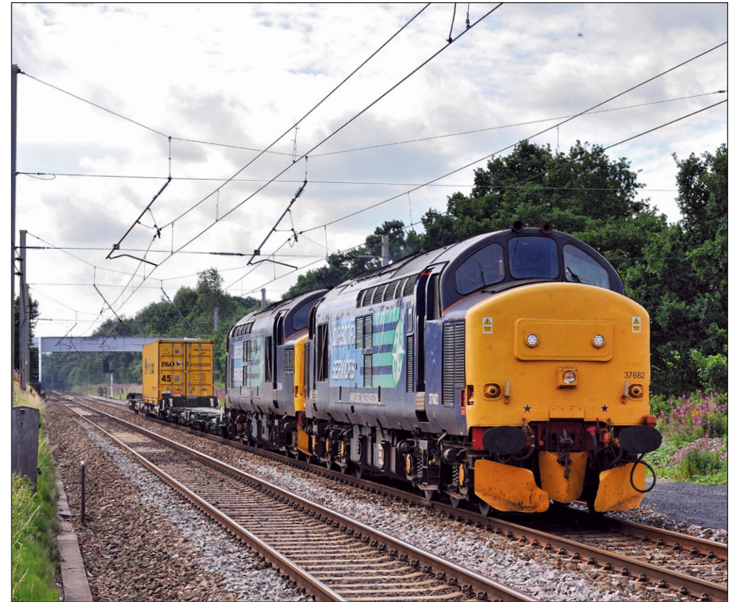
▲ On 24th July, DRS Class 37/5 No. 37682 and Class 37/0 No. 37194 power a lightly-loaded Ditton to Tees Dock intermodal service, on the approach to Balshaw Junction on the WCML. Dave Dean

Further details are available on the National Express East Anglia website at http://www.nationalexpress-eastanglia.com , or call National Rail Enquiries on 08457 48 49 50.