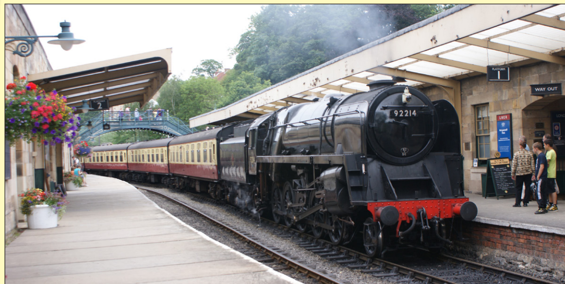
▲ BR Standard 9F 2-10-0 No. 92214 arrives at Pickering on 26th July. David Hainsworth

local council, and are to be flattened to make way for houses, although Barrow Borough Council says some of the dressed stone and arches will be saved for future suitable developments. The works was closed in the early 1930s, a decade after the Furness Railway was taken over by the LMS in 1923.