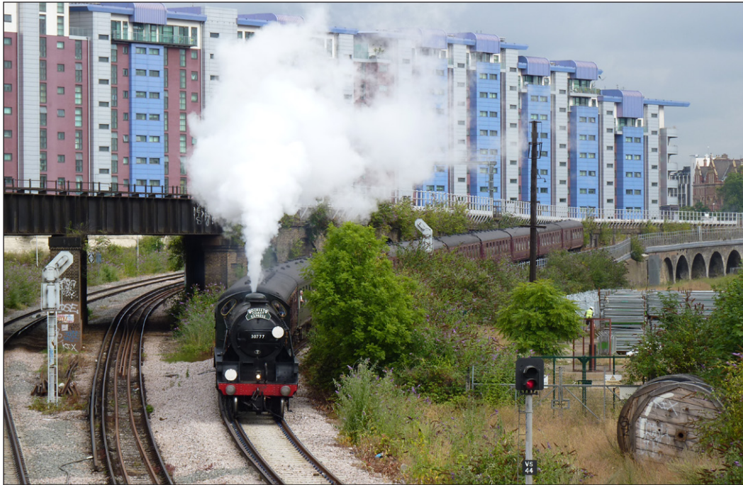
▲ SR 4-6-0 No. 30777 Sir Lamiel, coasts down the 'slip road' towards Stewarts Lane, passing Battersea Power Station, with the 'Dorset Coast Express' on 4th August.