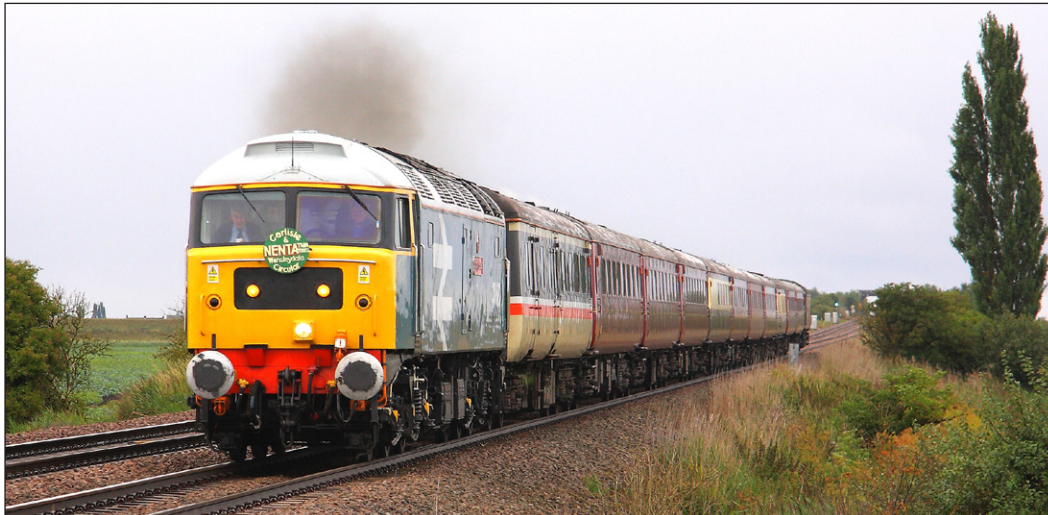
▼ Class 47/4 No. 47580 County of Essex heads the 'Settle & Wensleydale Circular' charter, with WCR Class 47/4 No. 47826 on the rear, near Manea on 7th August.