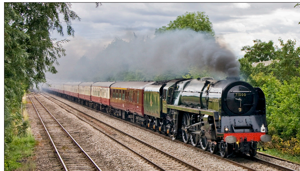
▲ Drawing many admiring glances, BR Standard 8P Pacific No. 71000 Duke of Gloucester makes a rare visit to the Bristol-Birmingham main line, as it passes Ashchurch on 26th July, with 'The Midland Tornado' charter from Gloucester to London Waterloo.

Inverness is the destination on 4th September, operating from Carlisle and the Glasgow & South Western route through to Paisley Gilmour Street, while on 1st October, Pitlochry and Aviemore will be visited from Llandudno Junction and North Wales coast stations. The next day, Blaenau Ffestiniog receives its second visit in as many weeks with a DBS Class 66-hauled working from Shrewsbury, which also picks up at Cannock Chase line stations, and offers a set-down at Betws-y-Coed for the town and railway museum.