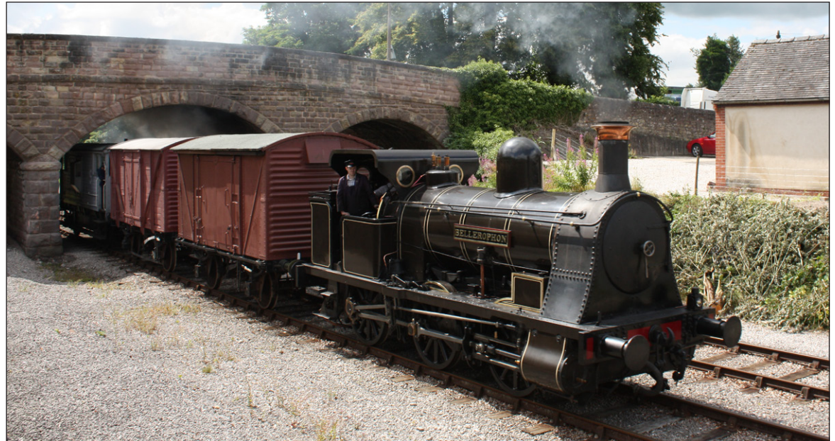
▲ Haydock Foundry 0-6-0 well tank Bellerophon visited the Ecclesbourne Valley Railway for its steam gala weekends on 31st July, 1st and 7th/8th August. On 2nd August the 1874-built locomotive took part in a photographic charter, and here approaches Wirksworth station with a short freight train.

A more unusual visitor will be the star of the GCR's 'Veterans Weekend' booked for 18th/19th September. It will be a RAF Chinook helicopter, which will be crewed by Afghanistan veterans, who will be available to give the public a guided tour of the helicopter. The Chinook will be at the event from Friday through to Sunday and its visit will help to raise funds for the RAF Benevolent Fund. Veterans of all services should note that they can travel for free during the event upon production of appropriate identification.