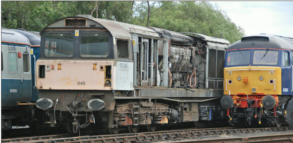
▲ Class 58 No. 58045, the source of spares for the Class 58 Project's main target, No. 58016, stands at Barrow Hill on 1st August, in the process of being stripped, prior to being scrapped.

▼ During the weekend of 31st July-1st August, the Llangollen Railway held its '1960s Gala', with a mix of steam and diesel locomotives. The Llangollen Diesel Group's resident Class 37 has undergone restoration into 1960s style and made its debut at the event in BR Blue and carrying its original number. During a brief spell of sunshine on 31st July, No. 6940 approaches Fisherman's Crossing with the 14.00 Llangollen-Carrog service.