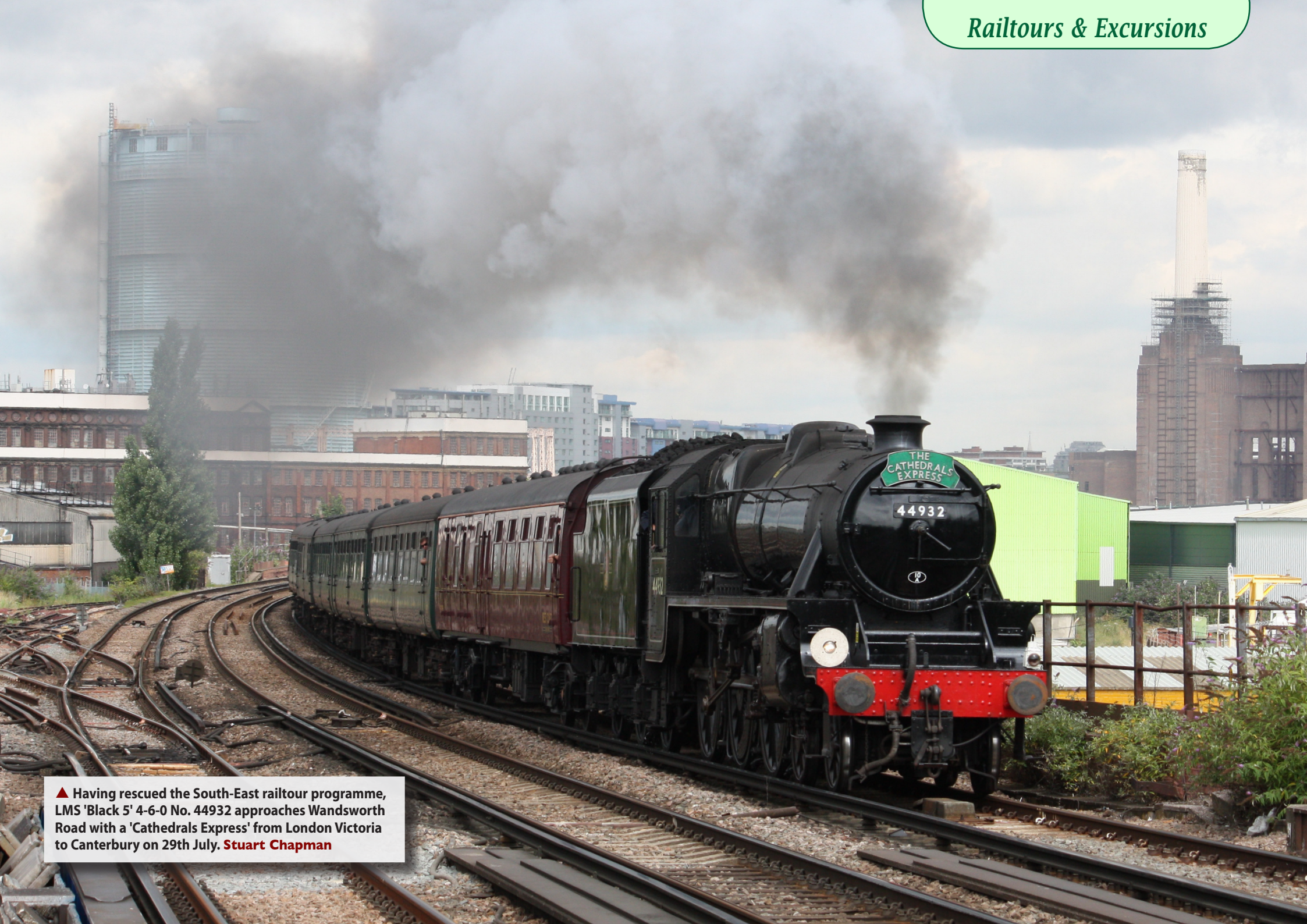
▲ Having rescued the South-East railtour programme, LMS 'Black 5' 4-6-0 No. 44932 approaches Wandsworth Road with a 'Cathedrals Express' from London Victoria to Canterbury on 29th July. Stuart Chapman