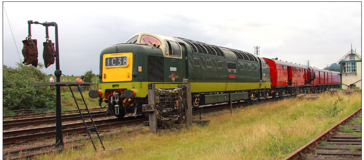
▼ The fourth and final Travelling Post Office Demonstration of the day, Class 55 Deltic No. D9009 Alycidon powers through Quorn & Woodhouse during the Great Central Railway's 'Mail By Rail' gala on 24th July, with the line's set of recently-repainted TPO carriages, performing an 'on the move' mailbag transfer. Kev Gregory