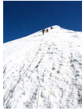
route to the summit!