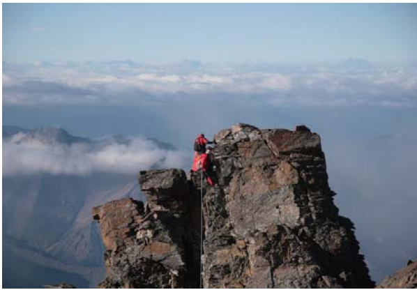
Crossing LuoTuoBei or Camel's back