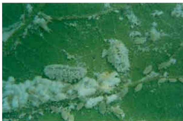
Figure 2. Two fully grown larger larvae of S. epius feeding on mealybugs.