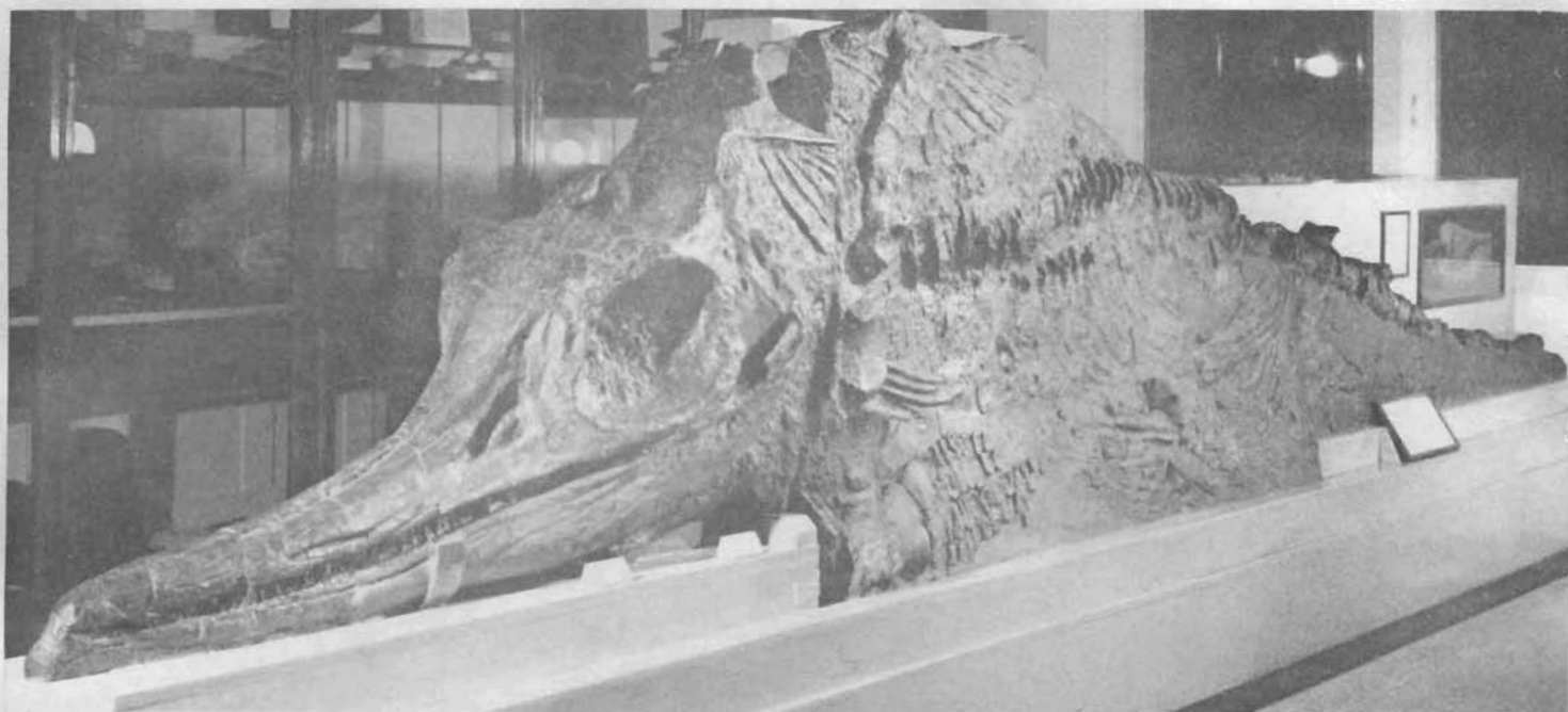
Fig. 1 ICHTHYOSAURUS CRASSIMANUS Owen Upper Lias, Whitby , Yorkshire