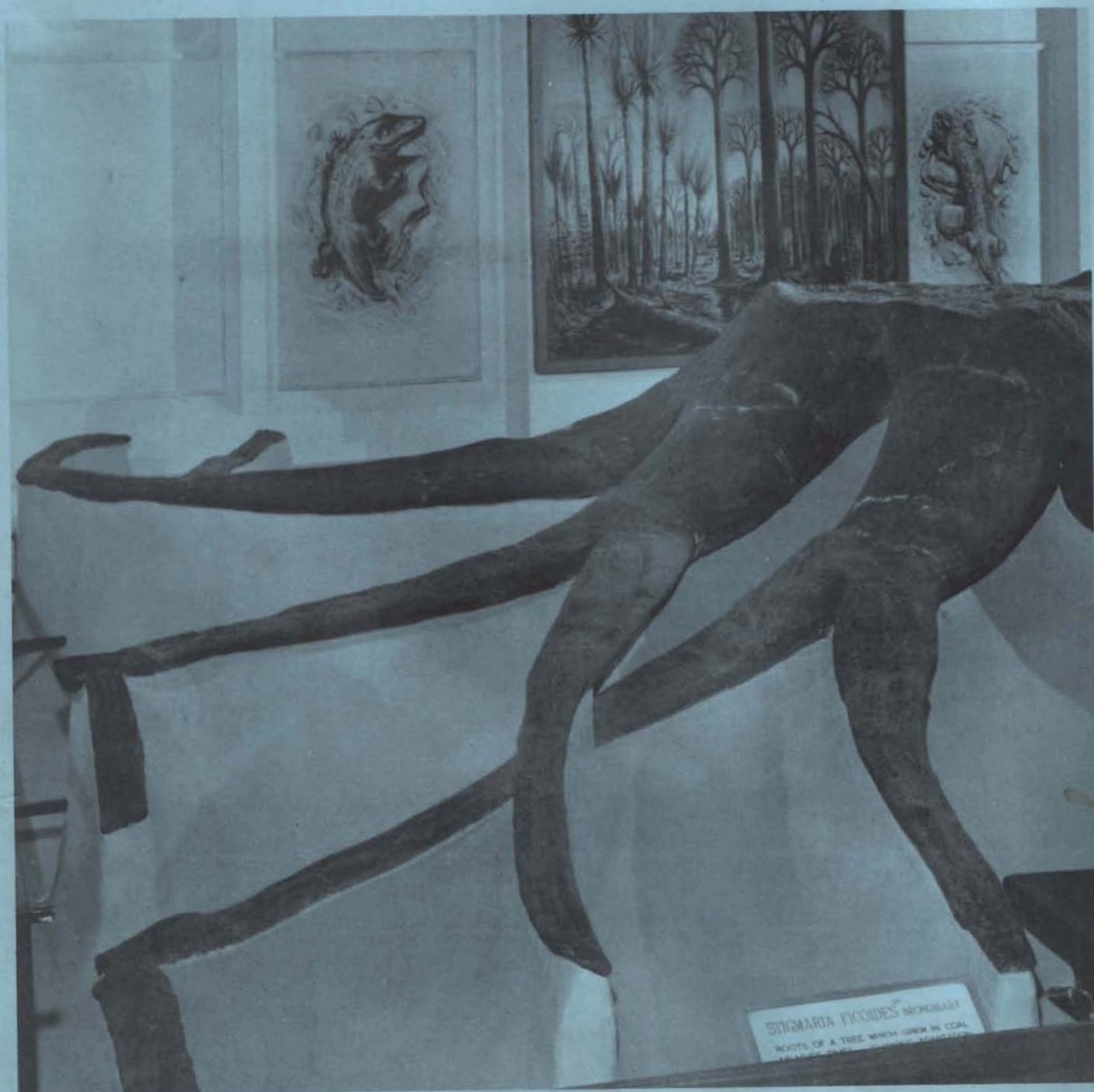
STIGMARIA: MANCHESTER MUSEUM