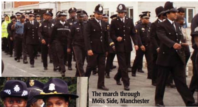
The march through Moss Side, Manchester