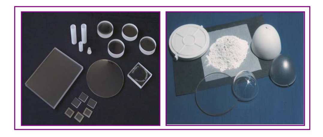
Figure 2: ALON<sup>™</sup> powder and various useful parts made of ALON