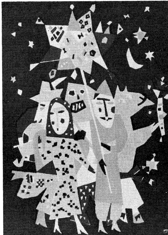
From a Christmas card published in Ukraine, author unknown, 1992.