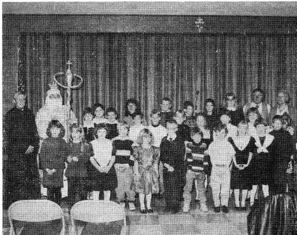
St. Nicholas visits UNA Branches 164 and 333.

All guests young and old alike enjoyed a delicious buffet and refreshments.