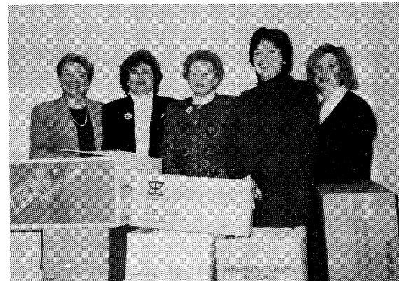
Members of the auxiliary pose with supplies for CCRF hospitals.