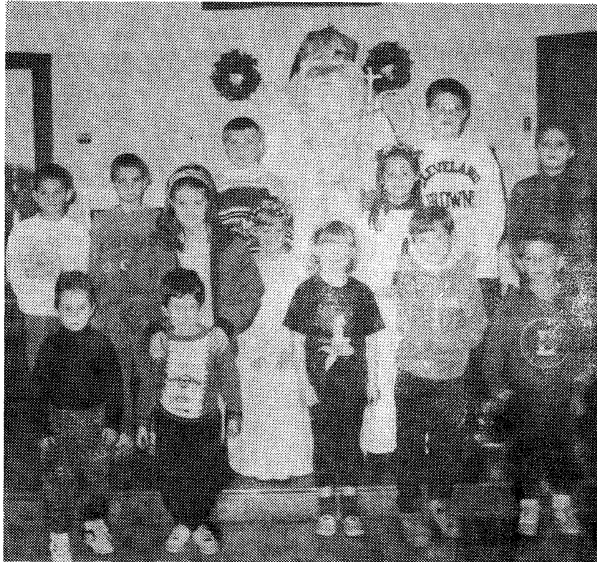
St. Nicholas visits UNA Branch 349 in Manville, N.J.

Everyone had a good time. The children are already anticipating St. Nicholas' coming next year.