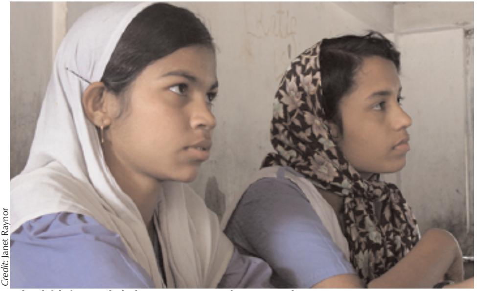
Schoolgirls in Bangladesh (see Box on p.2 for case study).

An introductory paper to the Beyond Access Programme Insights introduces some of the cross cutting themes, identifying areas in which action must be taken. These include addressing the social factors that limit demand for girls' and women's education; ensuring that education is seen as valuable and relevant by girls and women themselves as well as by their communities and addressing school cultures to ensure that schools are made welcoming for girls. Ensuring that teachers, especially female teachers, are given the support they need to make schools transformative places in which gender stereotypes and inequalities can be challenged is crucial, as is eradicating sexual harassment and violence against female teachers and students.