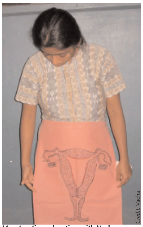
Menstruation education with Vacha.

"Many Eritrean schoolgirls either miss school entirely or feel uncomfortable at school during their menstrual cycle, and hence report a decrease in their participation and performance in the classroom."