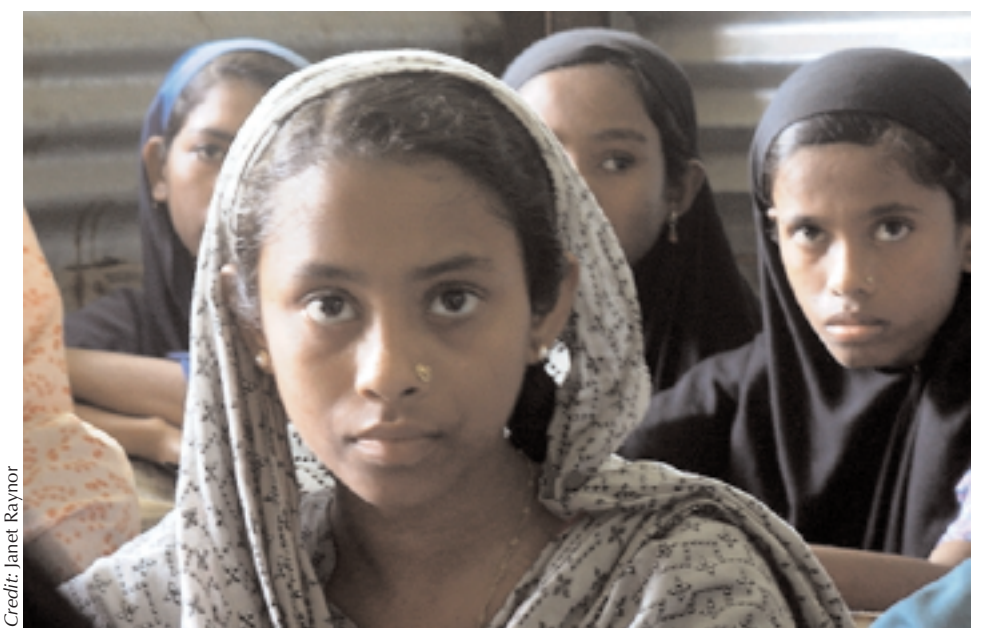
Schoolgirls from Bangladesh, where there have been large increases in the number of girls attending school following a secondary school stipend scheme.

As the third year of the Beyond Access project - and a crucial year for gender equality in education - draws to a close, this article considers how to progress in going 'beyond access'. Our project is premised on the understanding that getting equal numbers of girls and boys into school is a necessary but not sufficient condition for achieving gender equality in education. So what are the decisive changes that create true equality of opportunity and outcome? What have we learned that we can take forward beyond 2005 to ensure that the gender equality and education Millennium Development Goals are met as soon as possible, and certainly by 2015?