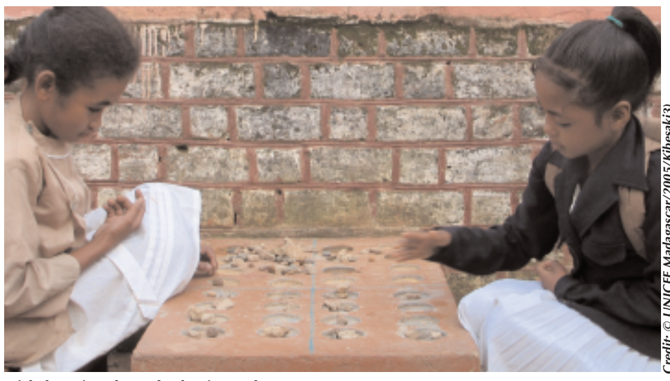
Girls learning through play in Madagascar.

This success has led to claims by some that the country has achieved MDG 3. It was also undoubtedly one of the reasons behind Bangladesh being showcased in the 2005 Human Development report (UNDP, 2005) as one of the countries making the