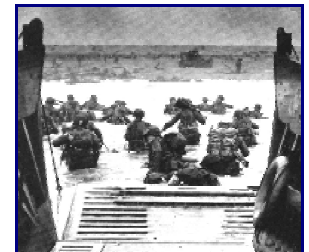
American soldiers wade ashore at Normandy.

At the Monday evening staff meeting, after much debate among the three forecasting cells and having seemingly been heavily influenced by the AAF weather team, Stagg told Eisenhower that Tuesday morning would provide a window of opportunity in which to launch the invasion. Eisenhower ordered D-Day execution for Tuesday, June 6, 1944.