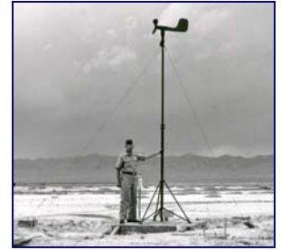
AWS began installation of the AN/GMQ-1, Wind Measuring Set in 1954.

September 10, 1965 , Air Force launched the first Defense Meteorological Satellite Program (DMSP) satellite.