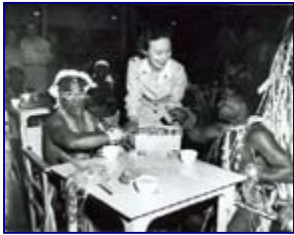
A Red Cross worker gives chewing gum to New Caledonian dancers after they entertain U.S. troops, 1944.