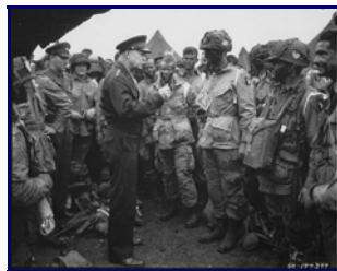
General Eisenhower reads the invasion force.

The operation was a complex interaction of air, land, and naval forces that required a precise set of parameters to foster success, including clear skies, full moon, and low tide. After taking command of Allied forces, GEN Dwight D. Eisenhower directed a climatological study to determine the best timing for the invasion. He selected Monday, June 5, 1944, to be D-Day.