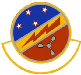
The current 17OWS emblem was approved on June 9, 1982.