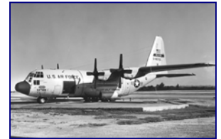
AWS transferred its fleet of WC-130s to the ARRS in 1975.

"Weather and communications men usually work together as a team."