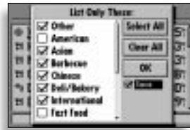
Customize points of interest