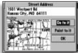
Find an address