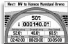
Keep track of your trip