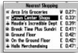
Find points of interest