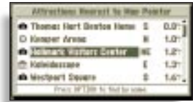
Select a specific site†