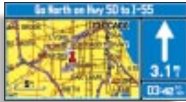
See yourself on the map*