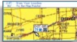
Built-in U.S. Interstate exits*