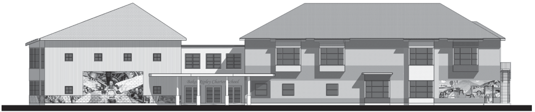
Elevation, illustrating the public art “canvas” walls.

of social services under one roof and which is where NCI has been housed since the building’s completion.