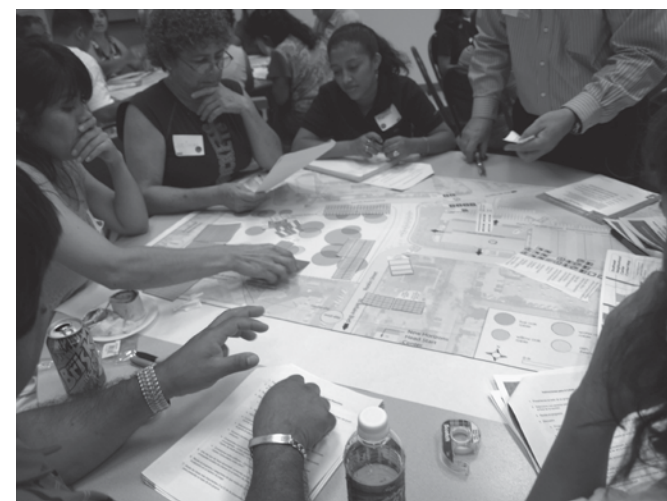
ABOVE AND BELOW: Baker-Ripley Neighborhood Center Public Workshop.

NCI has had a presence in Gulfton for over a quarter of a century. In 1998 the organization opened The Bridge/El Puente in the Napoleon Square Apartment complex. In 2007, after decades of planning, the city of Houston opened the Southwest Multi-Service Center, which consolidated a number