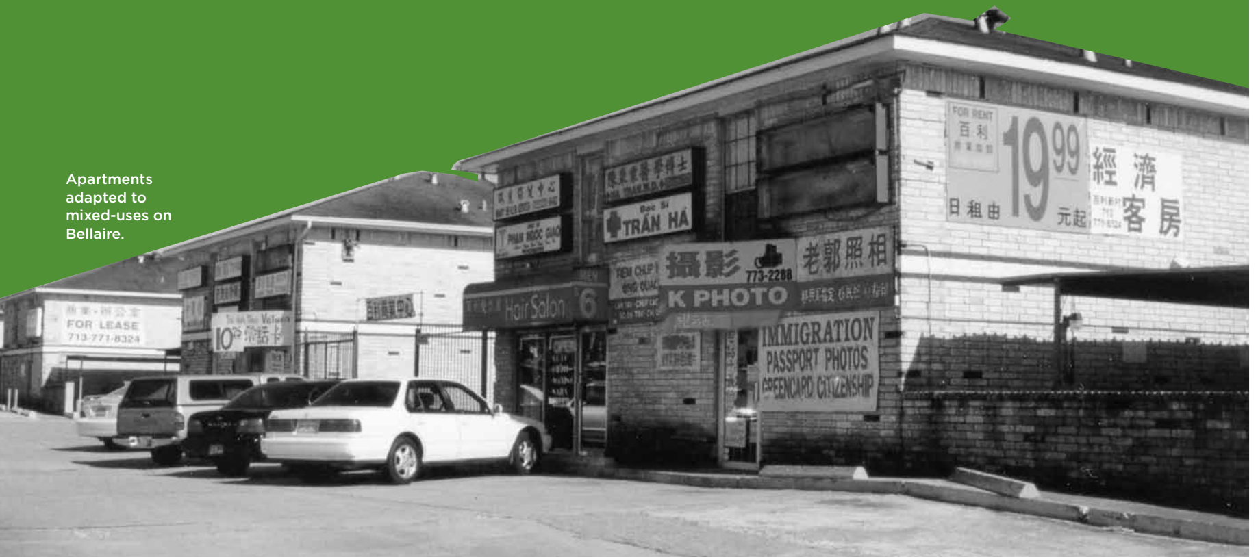
Apartments adapted to mixed-uses on Bellaire.