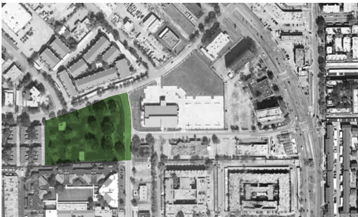
The site is an oasis in a sea of concrete.

The vision for the new neighborhood center emerged through a participatory planning process that was more than two years in the making. The design of the Baker-Ripley Neighborhood Center, currently under construction at the corner of Rookin and High Star adjacent to the Southwest Multi-Service Center, began with an “Appreciative Inquiry” that asked over 100 residents and stakeholders to identify the strengths of the neighborhood. Building from this foundation, the design team developed a preliminary program for the building, and everything—from the public spaces to the program to the architecture—became the subject of six additional public workshops. As noted by the Project for Public Spaces team, what emerged from the process was the vision that “community centers can be more than just buildings with an adjacent park; the whole facility, inside and outside, can