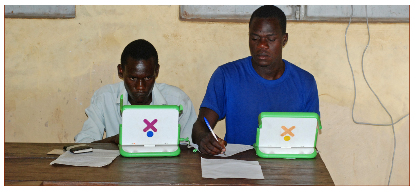
Students using the Internet for research at the Pagak Peace and Information Centre.