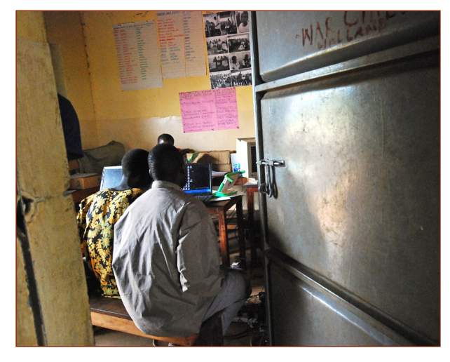
Top to Bottom: Pagak Peace and Information Centre's antenna connecting to the BOSCO network; a training at the Pagak Centre; a computer room in the Pagak Centre.

www.boscouganda.com twitter: @boscouganda