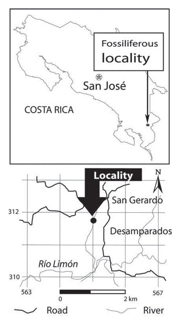
Fig. 1: Map of the locality of Limoncito, Coto Brus county, Puntarenas, Costa Rica. Coordinates according to Costa Rica Lambert Norte, used by the Instituto Geográfico Nacional, Coto Brus quadrangle.

of an old river system. These conglomerates are sometimes interlocked in and overlain by coastal sandy facies. Therefore, they clearly comprise the top of the Curré Formation. As such, they should not be confused with the fluvial conglomerates of the Paso Real Formation.