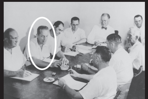
Serving on the 1952 College Station City Council. ↓