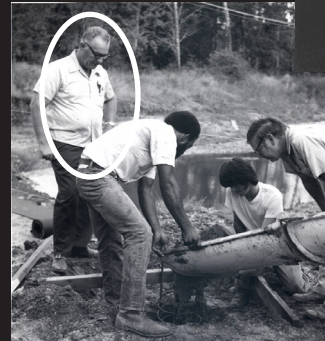
Overseeing the construction at Bee Creek and Southwood. c. 1960. ←