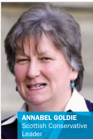
ANNABEL GOLDIE Scottish Conservative Leader

Real help for Scotland. Common sense policies delivered by Scottish Conservative votes, for Scotland. Practical help for hard pressed families, communities and business. Scottish Conservative votes delivered these achievements and I am proud of them.