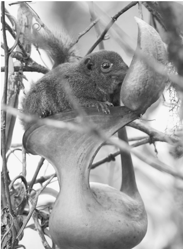
Figure 2. Tupaia montana feeding at an aerial pitcher of Nepenthes lowii .

The structure of N. lowii aerial pitchers facilitates both the feeding of T. montana on the lid exudates and defaecation into the pitchers. The thickened tendrils and robust pitchers can support an animal the size of T. montana (ca 150 g; Emmons 1991) without breaking. The highly reduced peristome enables T. montana to grip the pitcher rim without slipping, while the shape of the mouth and orientation of the lid impede feeding from the side or rear, thereby manoeuvring the animal to sit astride the pitcher orifice, maximizing the likelihood that the animal's hindquarters are positioned over the orifice while it feeds (figure 2).