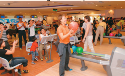
A strike in the making.