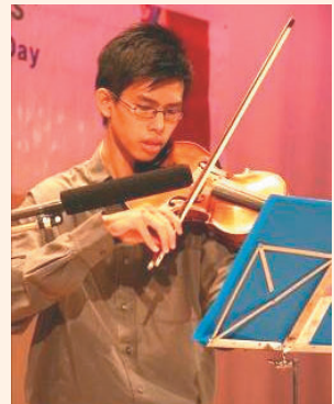
Performances by students of KCPPS & KCPSS

Before Elder Kok Siew Hoong unveiled the plaque,