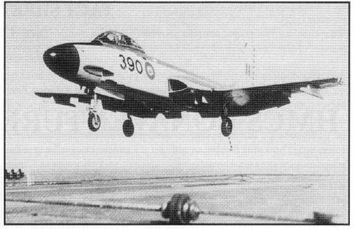
An F2H3 Banshee about to "trap" aboard Bonaventure.

On 3 April 1969 the government announced a "phased reduction in Canada's NATO commitments", a harbinger of the end of Naval Air in carriers, for attention was swinging to the somewhat cheaper operation of helicopters from destroyers. Saving money was the key, with major cuts in personnel, and Bonaventure's 1,350-man crew and her aircraft ate up a lot of both. In the summer of 1969 a planned docking in Saint John was cancelled in favour of a "self refit" alongside in Halifax. Then, via CBC radio, word reached the ship while on a NATO exercise in mid-Atlantic in September 1969 that Bonaventure was to be scrapped and her Tracker squadron disbanded. The ship's company was needed to man the new 280 Class helicopter-carrying destroyers just being laid down. So Bonaventure became the Navy's contribution to the defence cuts and the almost 50 per cent reduction in Canadian manpower contributed to NATO. The last operational flight was on 28 October 1969. In January 1970, Bonaventure carried a battalion of the Royal 22e Régiment to Jamaica for a tropical training exercise. Three months later she was sent to northern Norway, to Narvik, to bring back Canadian troops from a NATO exercise when their planned transport was not available. This was her last service.