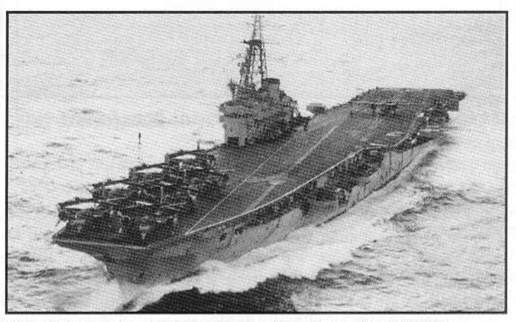
Canada's last specially-designed aircraft carrier HMCS Bonaventure under way. ND

Bonaventure ranged from the Arctic (1961) on a 5,200 mile voyage to assert Canadian sovereignty, to Buenos Aires (February 1966).