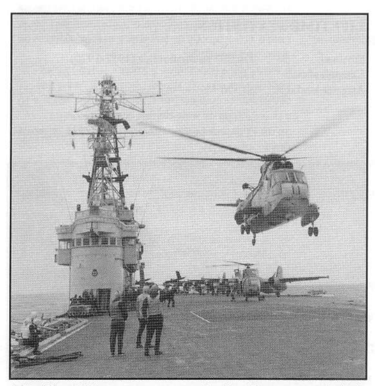
A Sea King Helicopter preapres to land on Bonaventure 's flight deck.

During her career with the RCN, Bonaventure (or "Bonnie" as she was usually known), was involved primarily in flying training in support of the Navy's various roles. These included control of the North Atlantic and adjacent areas, tracking Russian submarines operating in considerable strength there, and supporting North Atlantic Treaty Organization commitments. Her jet fighters, until 1962, were designed to provide protection in the event of enemy air attack, while her. Trackers and the helicopters assisted attendant destroyers and frigates in their anti-submarine searching and attack roles.