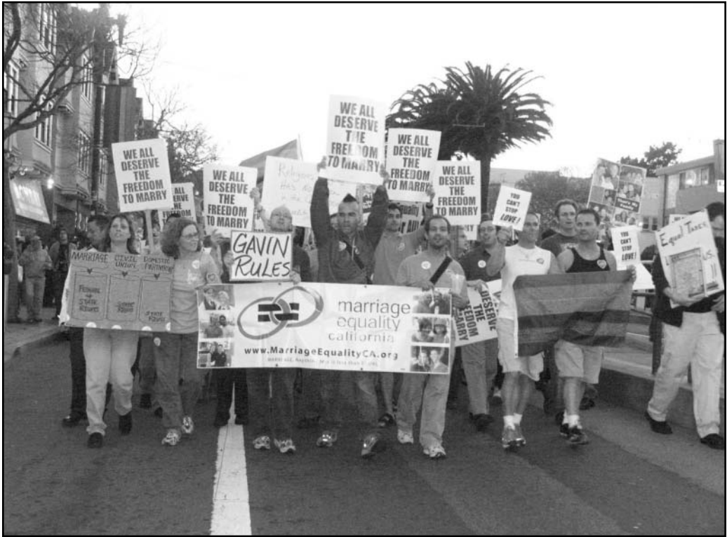
Photograph 4. Marriage Equality California leads anti-Proposition 8 protest in San Francisco.