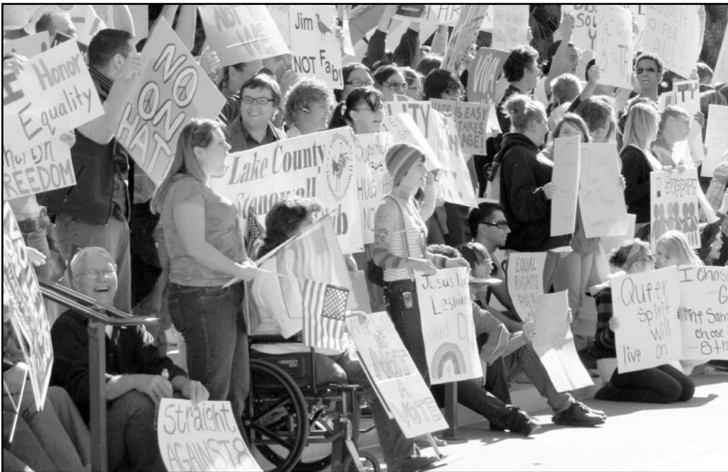
Photograph 6. Thousands of Californians gathered on the steps of the state capital building in Sacramento to protest Proposition 8.