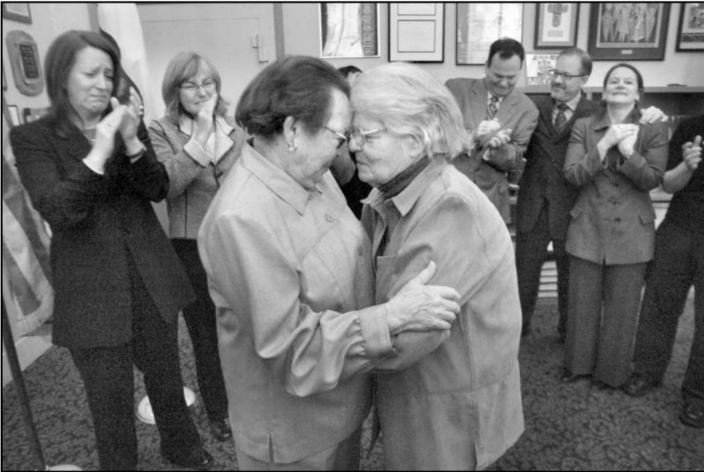
Photograph 2. Lesbian activists Phyllis Lyon and Del Martin, the first couple married at San Francisco's city hall.