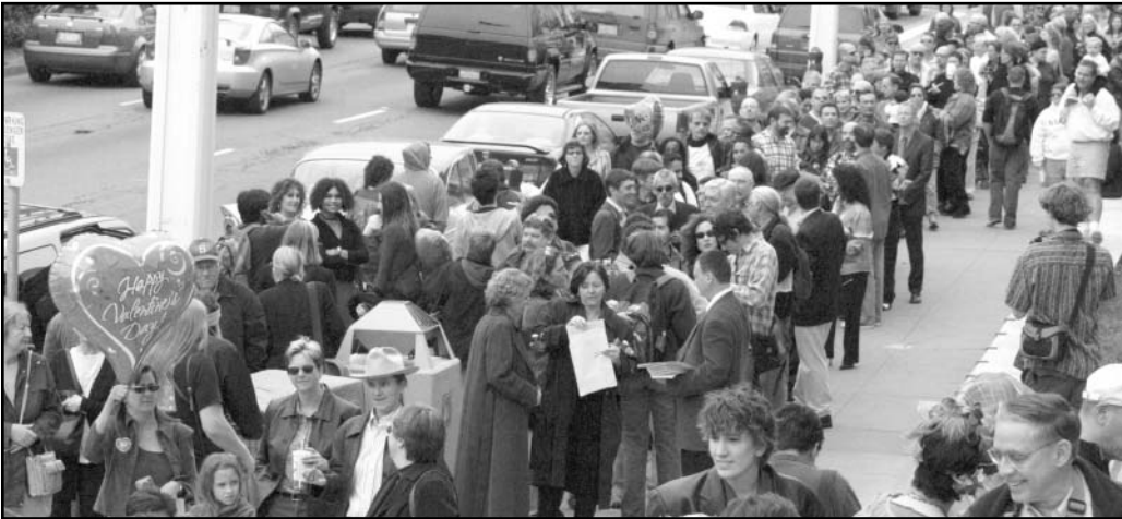
Photograph 3. Solidarity forms among couples waiting outside San Francisco's city hall to marry on Valentine's Day.