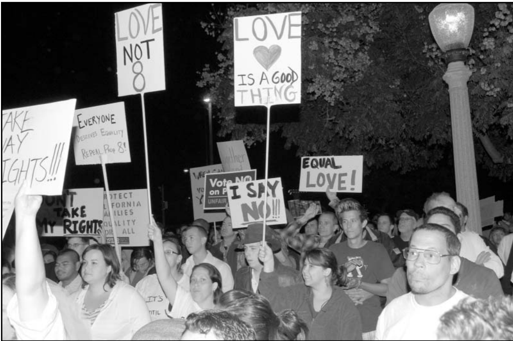
Photograph 5. Thousands protest in San Diego after the passage of Proposition 8.