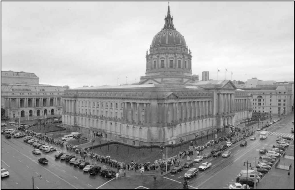
Photograph 1. Hundreds of same-sex couples, waiting for marriage licenses, in a block-long line around San Francisco's city hall.