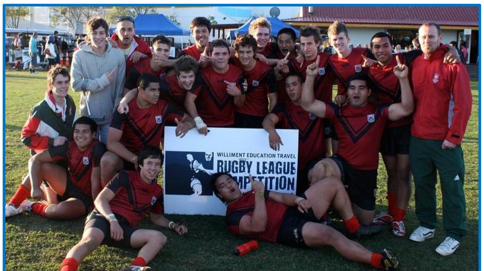
Westlake Boys High School, Winners of the 2009 Open Weight - Williment Education Travel North Harbour Secondary Schools Rugby League Competition

2009 was a very successful year for Auckland Representative sides with our 16's and 18's being crowned National Champions in the NPP while our 13's, 14's and 15's all had convincing wins over Waikato, these teams also played an Auckland development team as Northland pulled out of the annual fixture. The Auckland 15's also defeated the Wellington 15's and the 18's proved too strong for the touring Penrith under 17's.