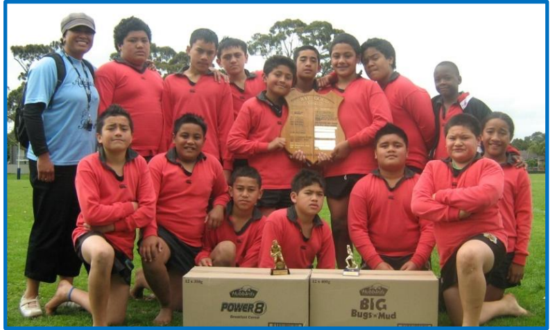
Pt England Primary, Auckland Rugby League Primary Schools Champions – Open Weight division

A total of 53 teams from 40 different Primary Schools competed this year, eventual Auckland Champions were Point England Primary (Open weight) and St Leonards Primary (Restricted weight).