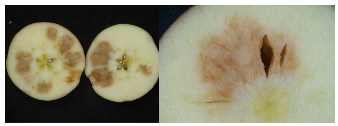
Figure 3. Internal controlled atmosphere injury from low O_2 and elevated CO_2 . Injury can be in small patches or large sections, depending on severity (left). The disorder can lead to the formation of more typical CO_2 injury (right) with time.

There appears to be a marked sensitivity to injury from low O_2 and elevated CO_2 . Research at Michigan State University since 2002 has revealed that, in addition to sensitivity to low temperatures, controlled atmosphere (CA) storage can also cause internal injury. CA injury looks similar to soggy breakdown, but may be a little less 'wet' in appearance. It can occur in air, but is much exacerbated by exposure to either low O_2 or elevated CO_2 (Fig. 3).