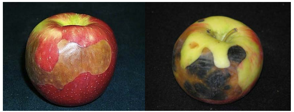
Figure 2. Soft scald on Honeycrisp. Injury begins as a ribbon-like light brown lesion with well-defined edges (left) and over time becomes dark brown as tissues degrade and decay begins (right). May or may not be associated with soggy breakdown.

Figure 1. Soggy breakdown of Honeycrisp. Internal injury (left) can extend to the surface in severe cases, (right) leading to surface browning that differs from the clean, sharp edges of soft scald (below).