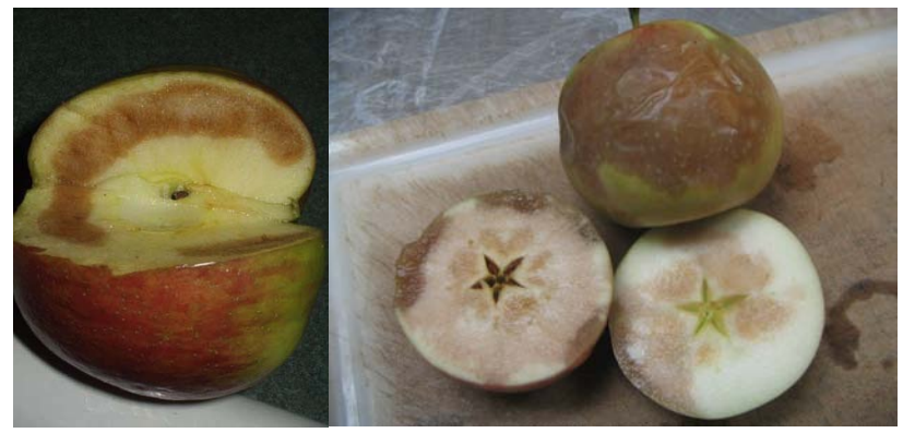
Figure 1. Soggy breakdown of Honeycrisp. Internal injury (left) can extend to the surface in severe cases, (right) leading to surface browning that differs from the clean, sharp edges of soft scald (below).

Although the variety was bred as part of a breeding program to develop winter hardy cultivars, the fruit have proven to be quite sensitive to low temperatures encountered in storage (Watkins et al, 2004, 2005). Low temperature injury symptoms include soggy breakdown (Fig. 1) and soft scald (a.k.a. ribbon scald or deep scald, Fig. 2).