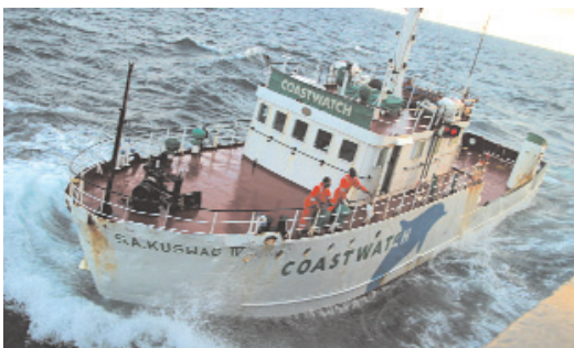
Specialised oil pollution abatement vessels are utilised in an effective response to a marine pollution emergency.

Our personnel are trained to effectively respond to any marine pollution emergency and are experienced in the use of oil pollution abatement equipment. We have a proven track record of over 30 years in the operation and