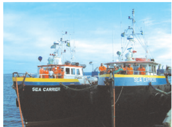
Efficient and timeous response to client scheduling is what makes our supply service so effective.

We provide logistic and support services to the offshore oil and mining industries in Southern Africa. Support is provided for oil exploration, production and anchor handling activities for work on the oil and gas fields south of Mossel Bay. Supply services to the offshore mining industry are provided out of Port Nolloth on the South African west coast and out of Cape Town. We provide that critical link between onshore and offshore operations where effective scheduling, operational efficiency and the ability to respond to our customers' needs timeously make us a sought after service provider.