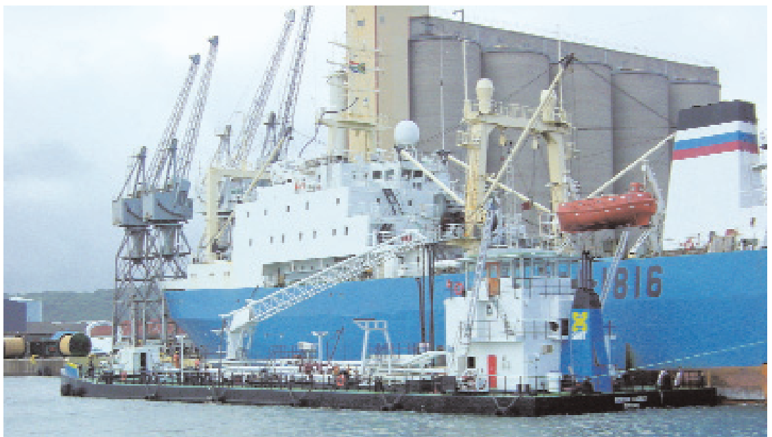
The bunker barge 'Pentow Energy' delivering product to a vessel calling at the port of Durban.