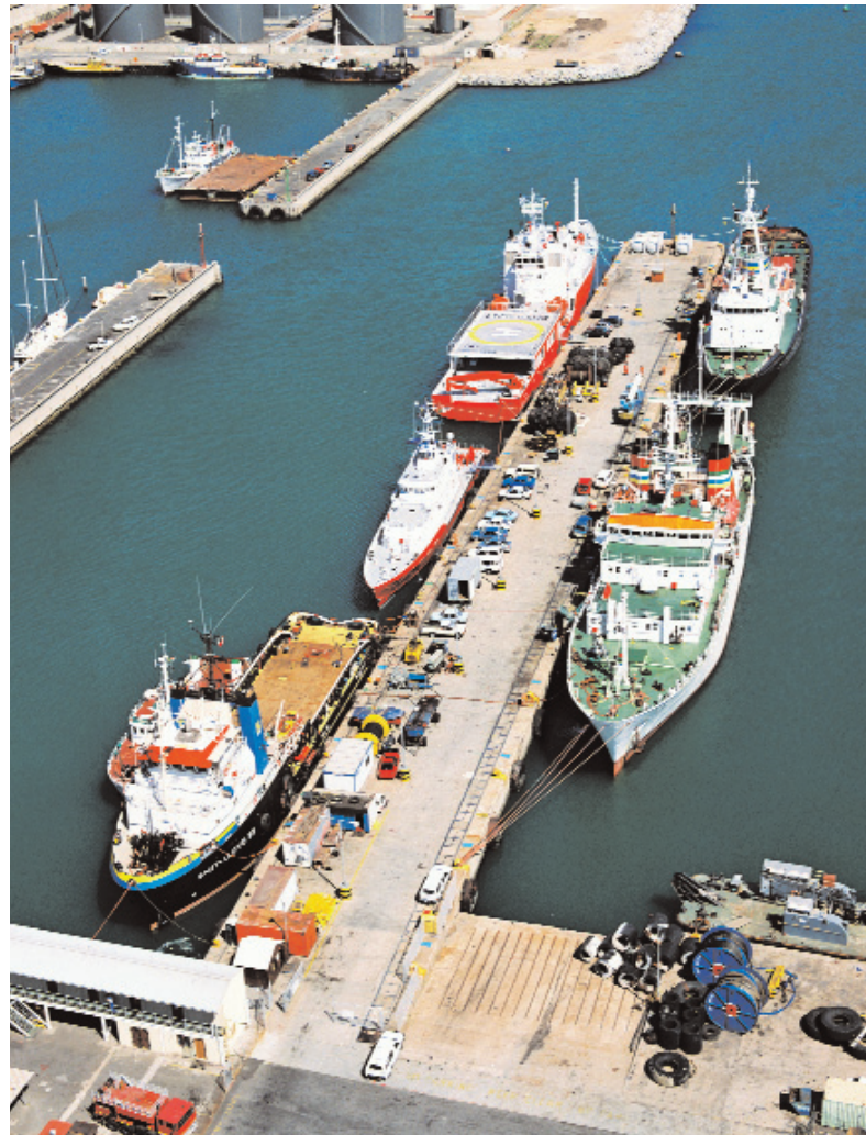
Our owned and managed fleets share dedicated quay space in the port of Cape Town.

We provide expert and professional support personnel, vessels, equipment and services in South Africa so that emergency marine response activities can be conducted speedily and professionally; with personnel being readily available 24-hours a day, 7 days a week.