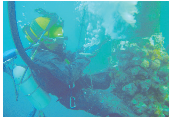
SMIT diver grit-blasting a subsea riser.

We proactively seek to develop the skills base for commercial divers in South Africa by recruiting, training and employing local divers on our operations.