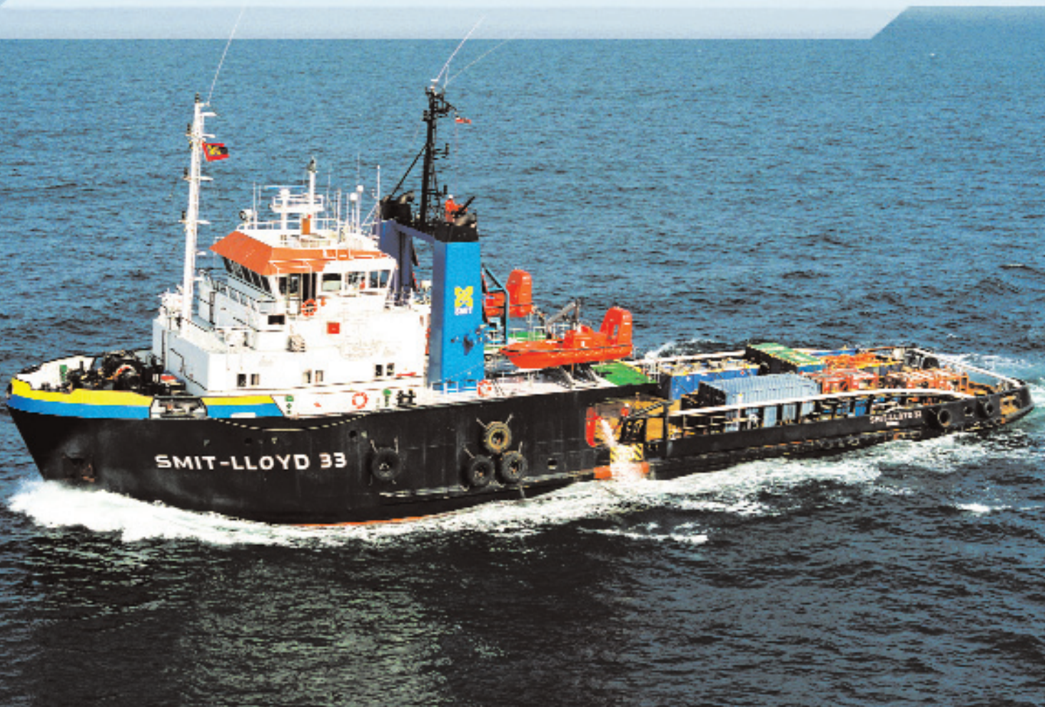
The anchor handling tug supply vessel 'Smit Lloyd 33' is fitted with two rapid deployment fast rescue craft.