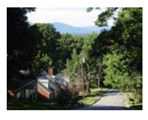
View atop Strother Road

This area is overwhelmingly suburban in character. The majority of development occurred after World War II. Suburban development is characterized by an orientation to the automobile, wide streets that enable higher speeds, subdivisions of large single-family houses with large front, back, and side yards, and shopping centers and strip commercial establishments with large parking lots in front.