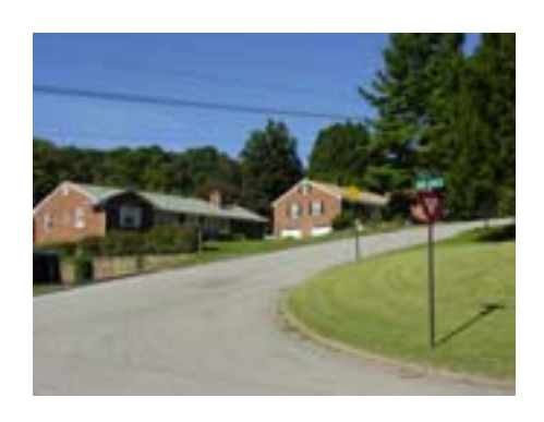
Intersection of Pasley Avenue and Bannister Street