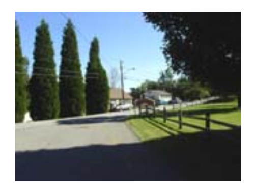
Intersection of Forest and Winding Way Roads

From Virginia Western east to Brandon Avenue, Colonial Avenue has four lanes and is consistently busy during, and between, peak hours. This stretch of the street lacks curb, gutter and sidewalk, and is unsafe for pedestrians. Its wide profile, especially at VWCC is notorious for speeding traffic, despite heavy pedestrian activity. East of VWCC, no area is allotted for pedestrian traffic. Many houses in the neighborhood off of the northern side of Colonial Avenue lie beneath the grade of the street. This neighborhood is dominated by one-story Ranch and Cottage style houses, but also has a few apartment buildings near Towers Shopping Center.