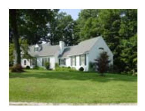
House on Creston Avenue