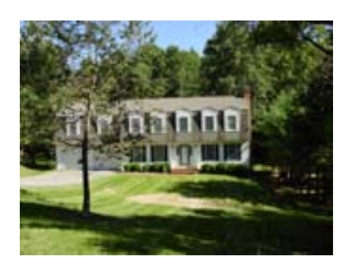
House on Forest Road