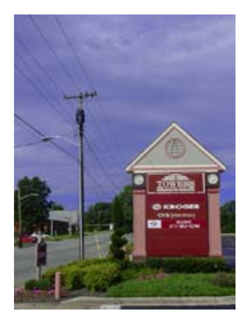
Towers Shopping Center on Colonial Avenue