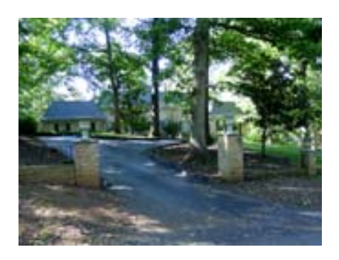
House on Winding Way Road

development on Colonial Avenue should be oriented toward the street with parking to the rear or side. The College Services Building is being constructed in this fashion, and should diminish the visual impact of the parking lots to some degree. Given the growth of the college, a parking garage could add to the campus' appearance and increase the number of parking spaces.