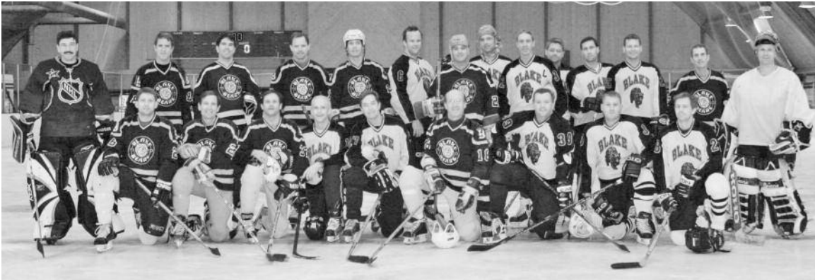
The “old-timers” brown and white teams included alumni from the classes of 1963 through 1990.

And last but not least, the alumnae and the girls' varsity team mixed it up on the ice with some alumnae and some varsity players making up each side. This fast-paced match up gave Blake's college-bound seniors a chance to play both with and against collegiate-level players.