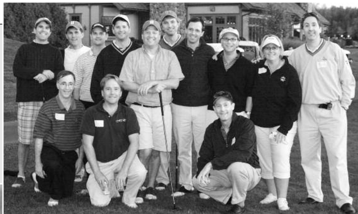
The class of 1981 was well represented on the links this year.