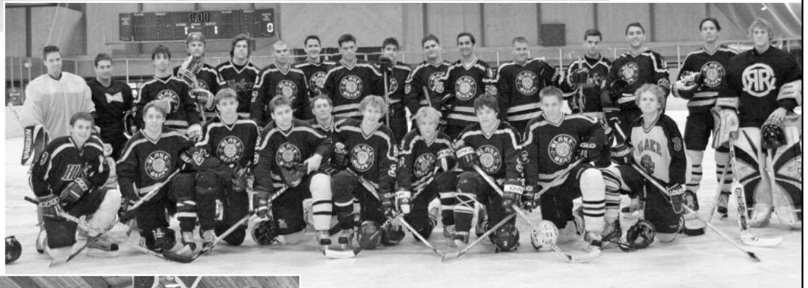
The young alums went head-to-head with Blake's boys' varsity team.