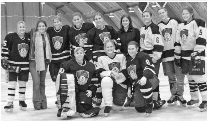
Mixing alumnae and girls' varsity players into two teams made for a fun, fast-paced game.